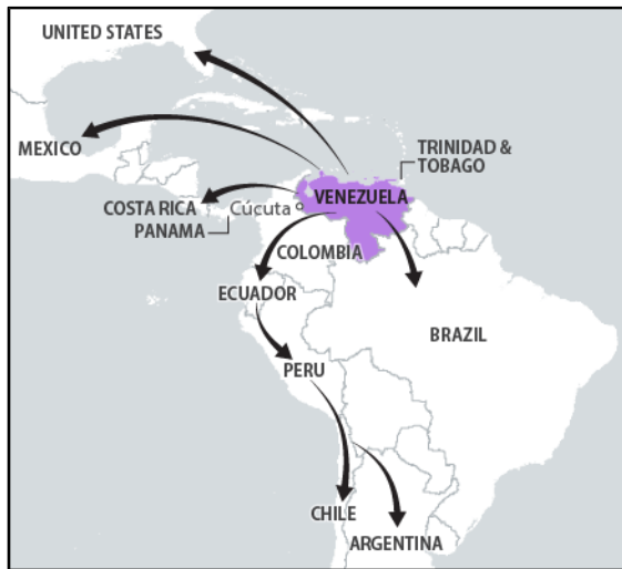
Figure 3. Venezuelan Migrants and Asylum Seekers: Flows to the Region and Beyond