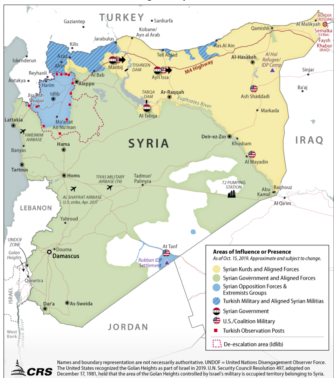
Figure 2. Syria

U.S. coalition partners will continue in these areas. The absence of stabilization programming in northeast Syria—where critical infrastructure was badly damaged as part of the U.S.-led campaign against the Islamic State—could leave local residents vulnerable and/or susceptible to recruitment by extremist groups. On October 12, the Administration announced that it was releasing $50 million "to protect persecuted ethnic and religious minorities, and advance human rights" in Syria and expressed its "hope that regional and international partners will continue their contributions as well."