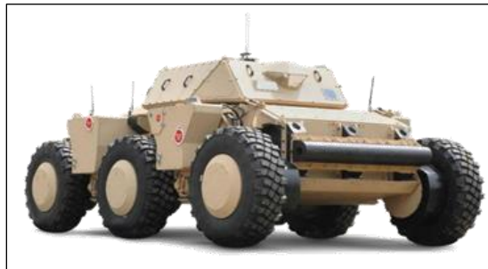
Figure 6. Illustrative RCV–M