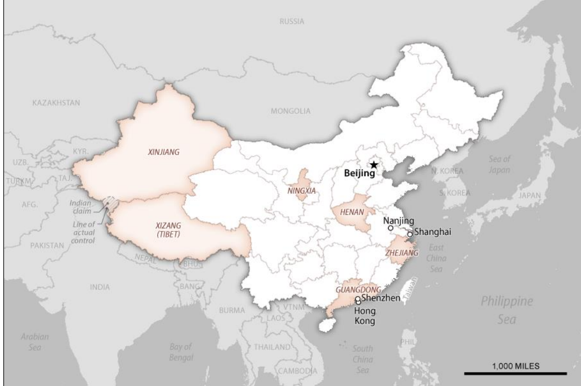
Figure I. Map of China: Selected Places of Notable Reported Human Rights Abuses