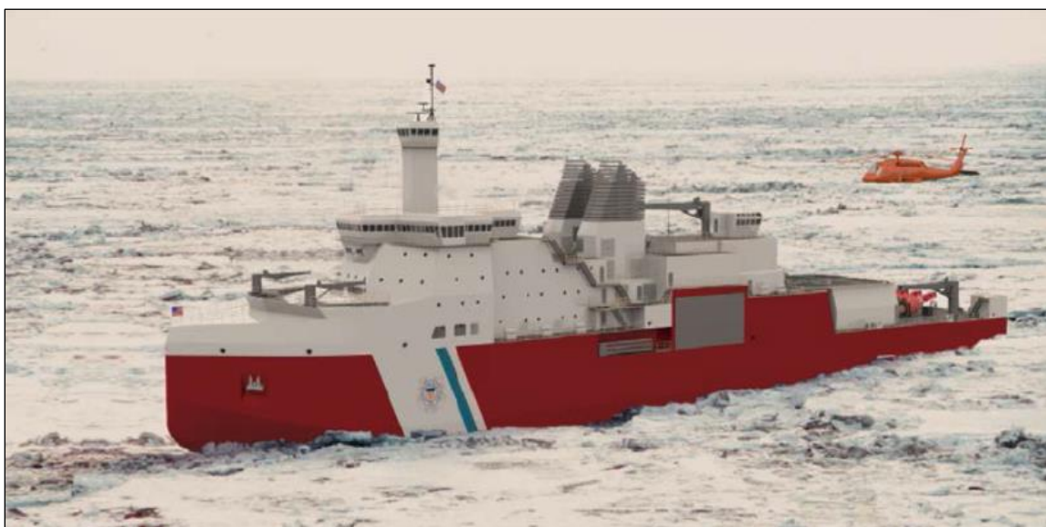
Figure 3. Rendering of VT Halter Design for PSC