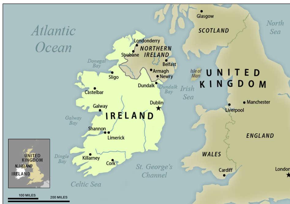
Figure 2. Map of Northern Ireland (UK) and the Republic of Ireland