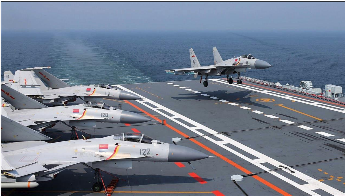
Figure 10. J-15 Flying Shark Carrier-Capable Fighter