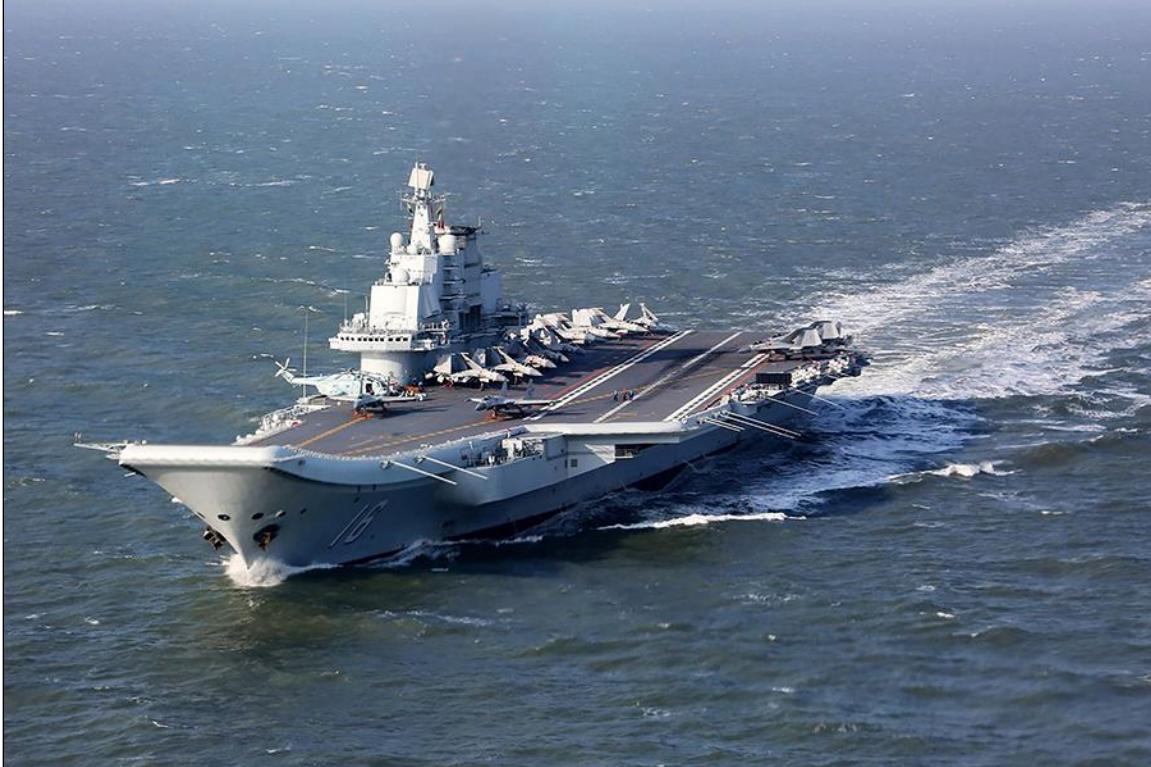
Figure 7. Liaoning (Type 001) Aircraft Carrier