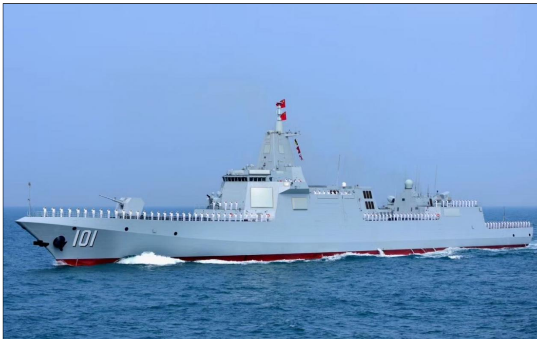
Figure 11. Renhai (Type 055) Cruiser (or Large Destroyer)