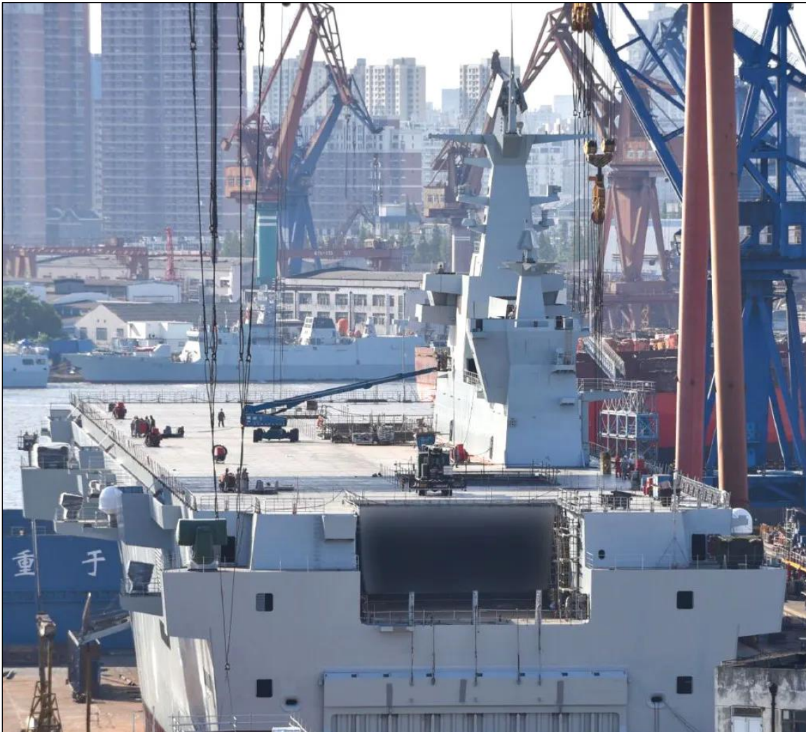
Figure 17. Type 075 Amphibious Assault Ship