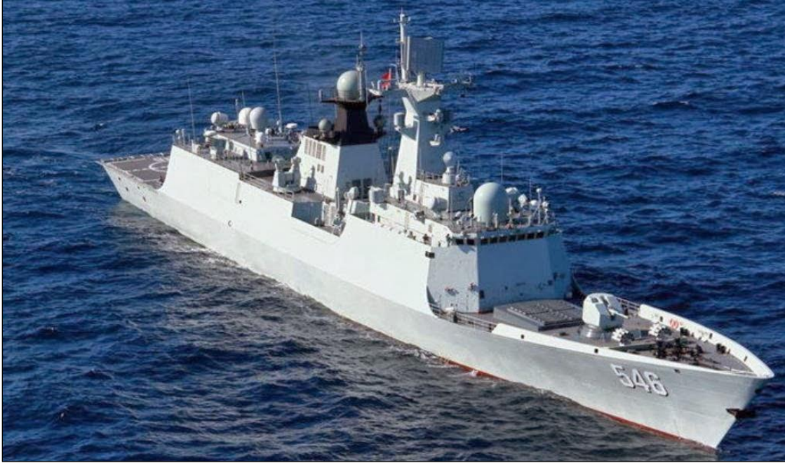
Figure 13. Jiangkai II (Type 054A) Frigate