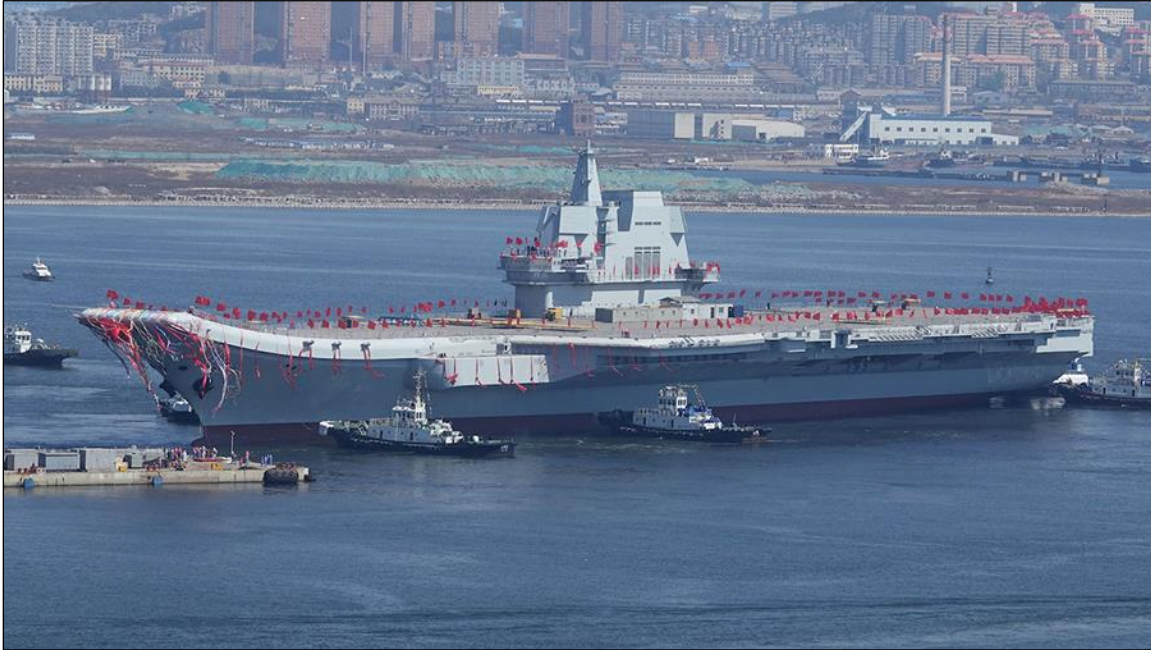
Figure 8. Type 001A Aircraft Carrier