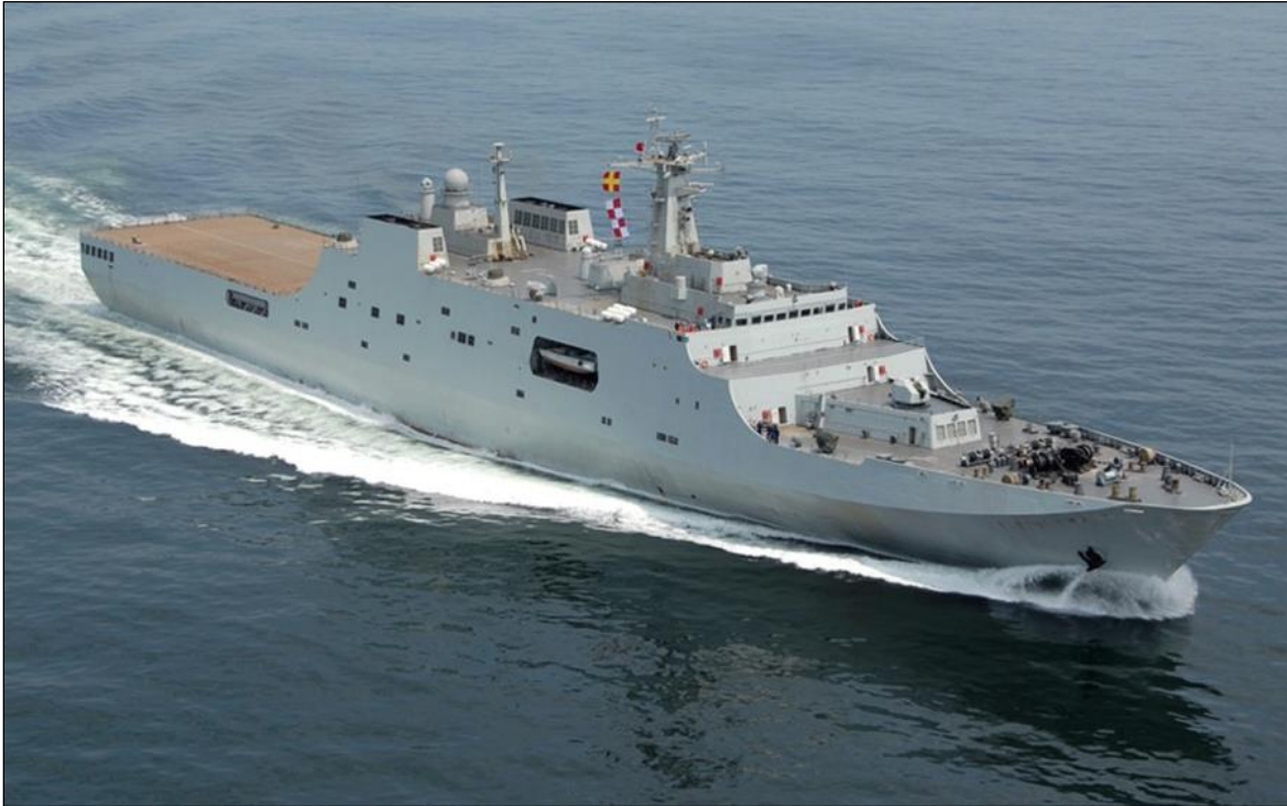
Figure 15. Yuzhao (Type 071) Amphibious Ship