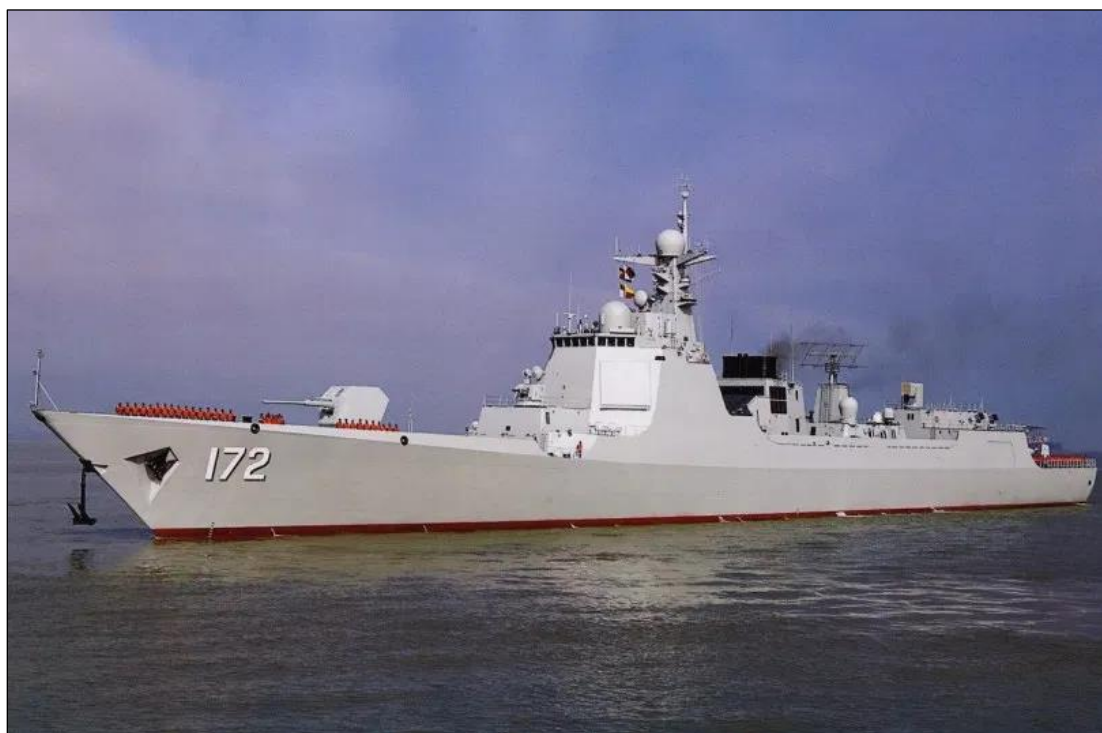
Figure 12. Luyang III (Type 052D) Destroyer