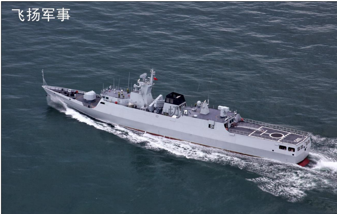
Figure 14. Jingdao (Type 056) Corvette