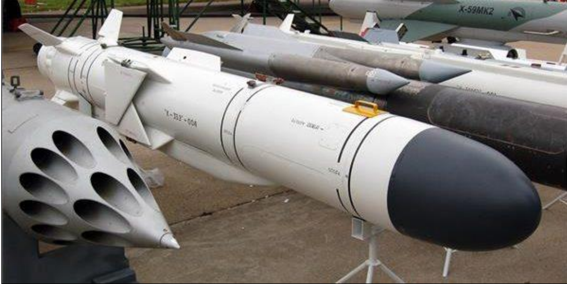
Figure 3. YJ-18 Anti-Ship Cruise Missile (ASCM)