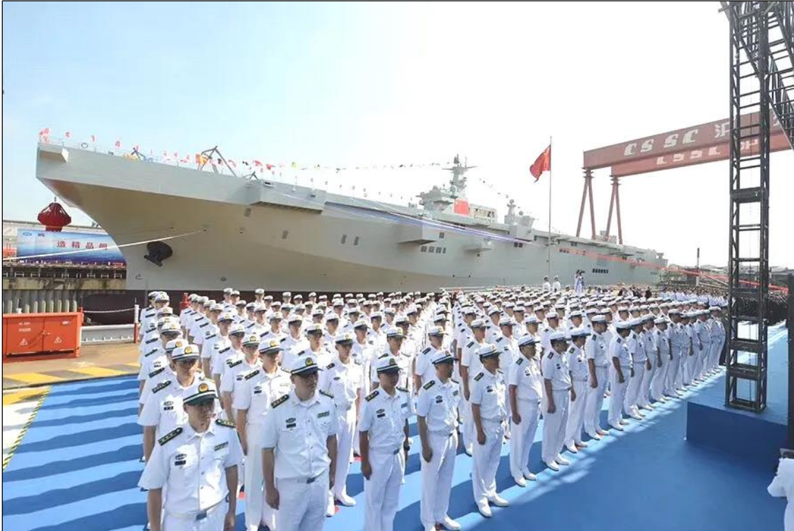
Figure 16. Type 075 Amphibious Assault Ship

Source: Photograph accompanying Joseph Trevithick and Tyler Rogoway, “China Just Launched Its Huge And Incredibly Quickly Built Amphibious Assault Ship,” The Drive , September 25, 2019. The caption to the photograph credits the photograph to China’s military. The same photograph accompanied articles about the ship’s launching that were posted by Chinese publications. See, for example, “China Launches First Home-Made Amphibious Assault Ship,” People’s Daily Online , September 25, 2019.