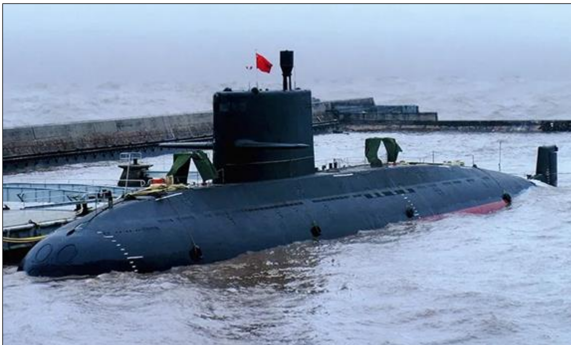
Figure 4. Yuan (Type 039) Attack Submarine (SS)