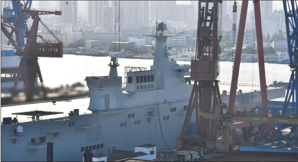
Figure 18. Type 075 Amphibious Assault Ship