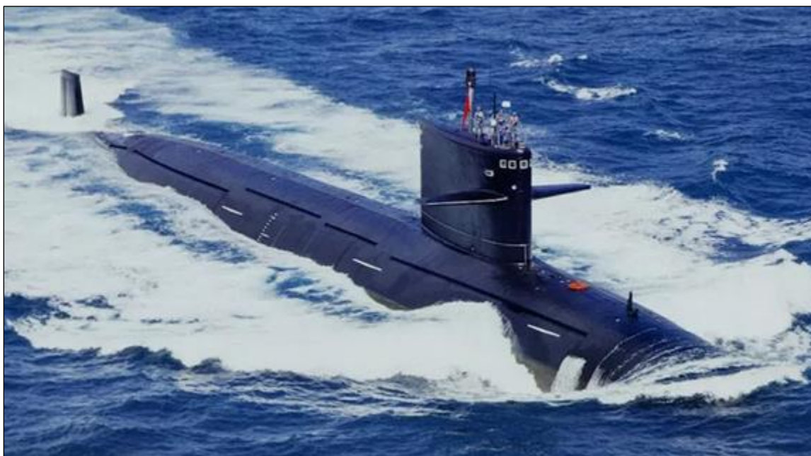
Figure 5. Shang (Type 093) Attack Submarine (SSN)