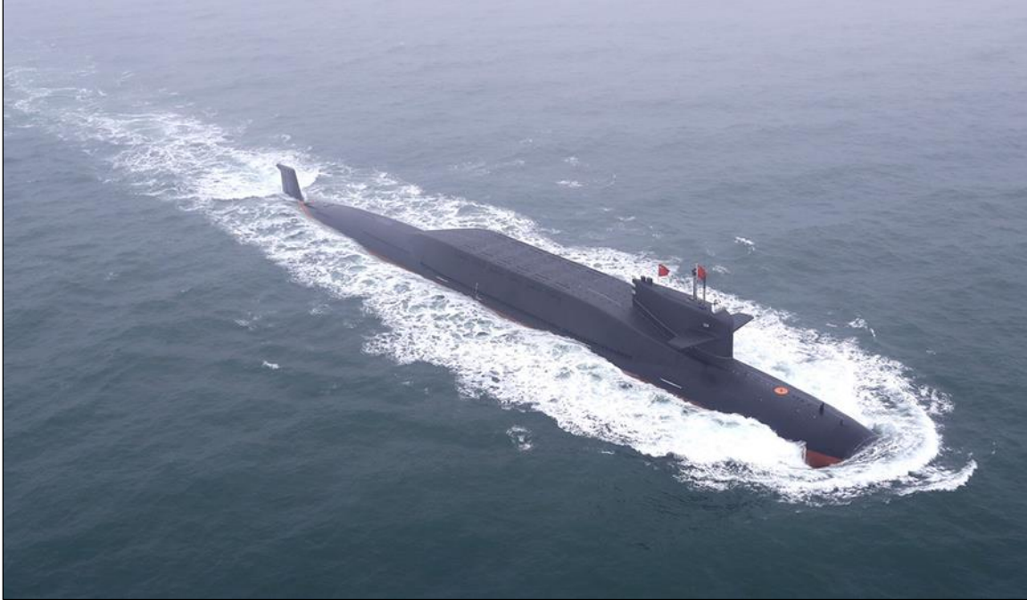
Figure 6. Jin (Type 094) Ballistic Missile Submarine (SSBN)

Source: Photograph accompanying Minnie Chan, “China Puts a Damper on Navy’s 70th Anniversary Celebrations As It Tries to Allay Fears Over Rising Strength,” South China Morning Post , April 23, 2019. The article credits the photograph to Xinhua.