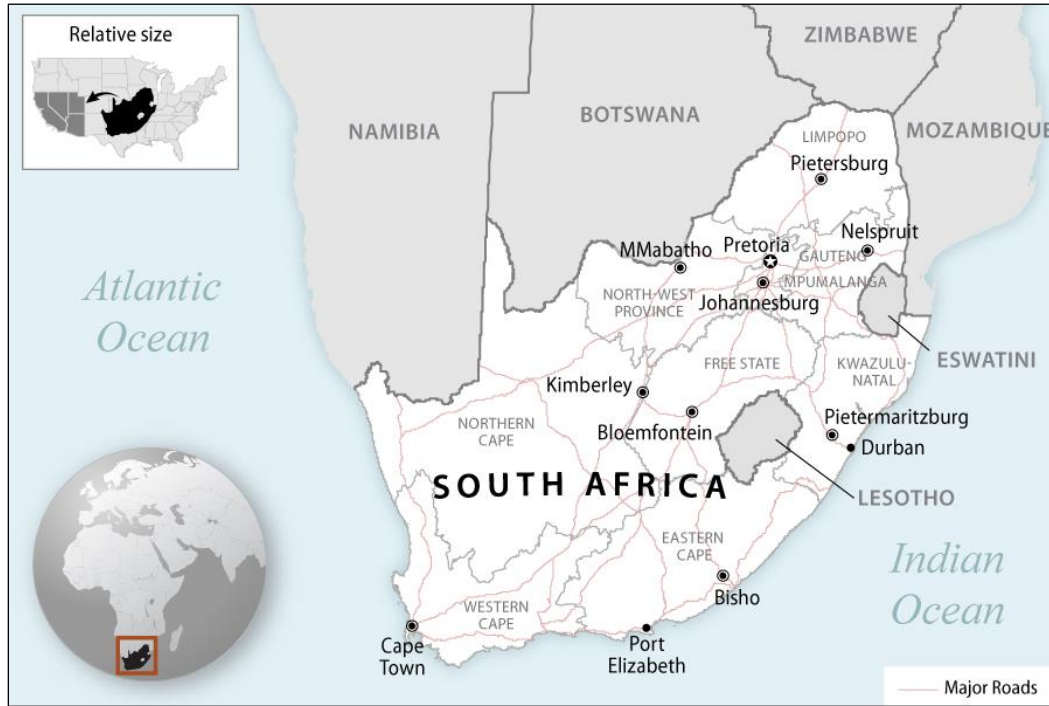
Figure 2. South Africa at a Glance (2019 data unless otherwise noted)