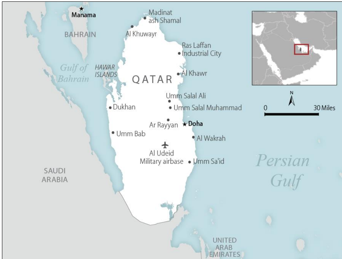
Figure 1. Qatar at-a-Glance