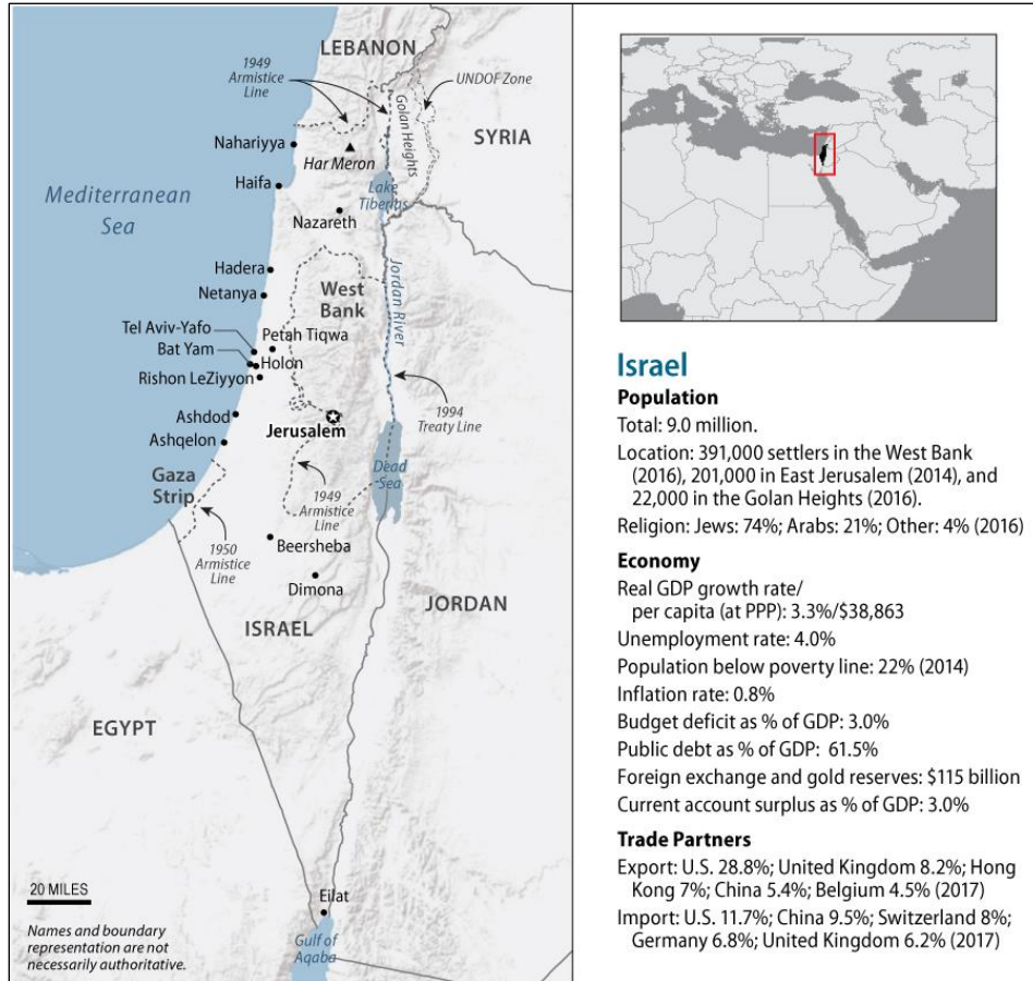
Figure I. Israel: Map and Basic Facts

Sources: Graphic created by CRS. Map boundaries and information generated by Hannah Fischer using Department of State Boundaries (2011); Esri (2013); the National Geospatial-Intelligence Agency GeoNames Database (2015); DeLorme (2014). Fact information from CIA, The World Factbook ; Economist Intelligence Unit; IMF World Outlook Database; Israel Central Bureau of Statistics. All numbers are estimates as of 2018 unless specified.