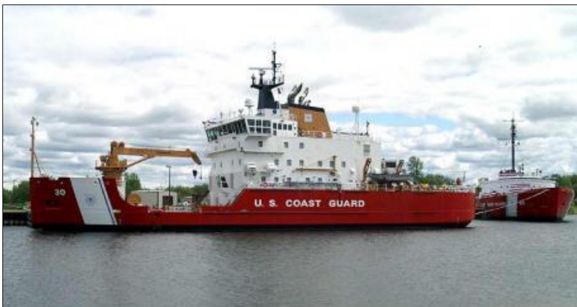
Figure E-1. Great Lakes Icebreaker Mackinaw