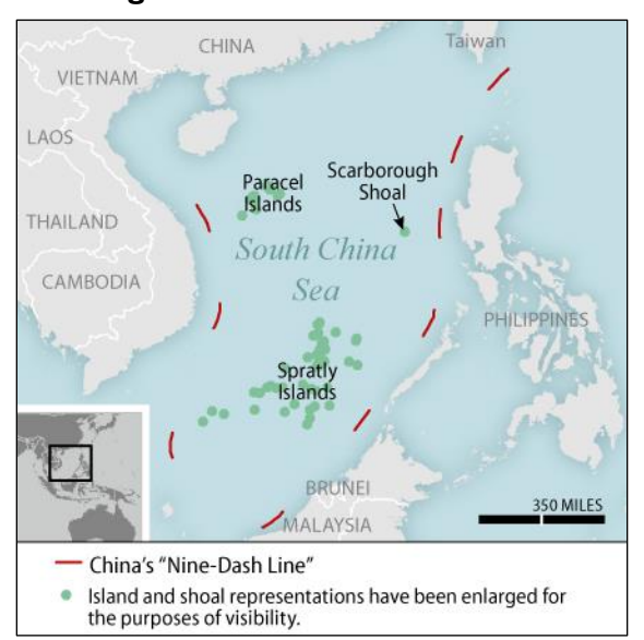
Figure 3. The South China Sea