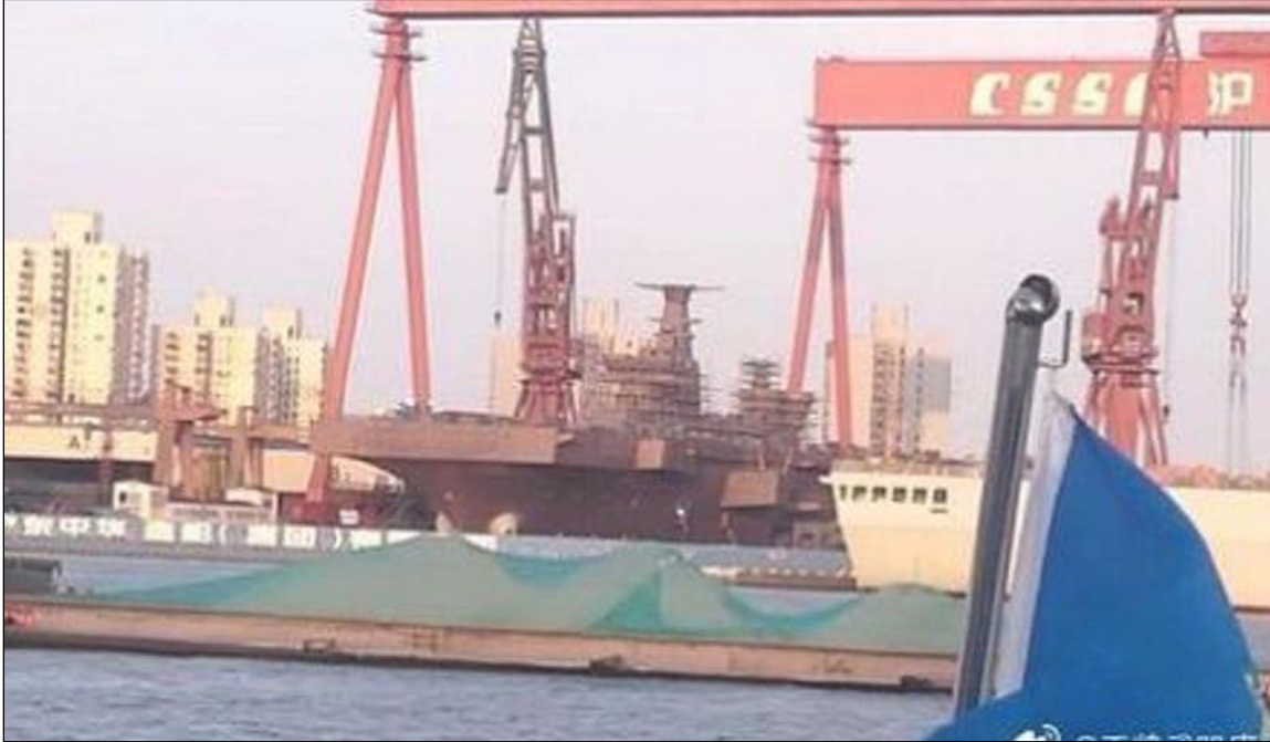
Figure 16. Type 075 Amphibious Assault Ship Under Construction