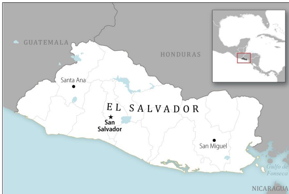
Figure 1. Map of El Salvador and Key Country Data

Polarization between the FMLN, a party formed by former guerillas, and ARENA, a party aligned with the military, has been the primary dynamic in Salvadoran politics since the civil conflict. From 1994 to 2008, successive ARENA governments sought to rebuild democracy and implement market-friendly economic reforms. ARENA proved to be a reliable U.S. ally but did not effectively address inequality, violence, and corruption. Development indicators generally improved, but natural disasters, including earthquakes in 2001 and periodic hurricanes, hindered progress. Moreover, despite ARENA’s probusiness policies, economic growth averaged 2.4% over the postwar years in which it governed. 8