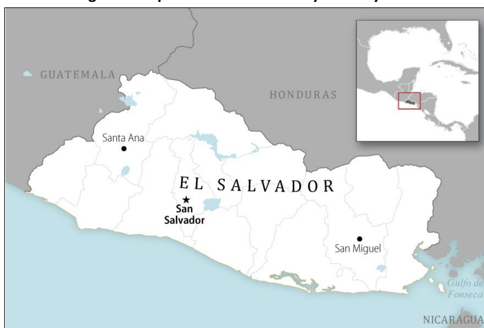
Figure 1. Map of El Salvador and Key Country Data

Polarization between the FMLN, a party formed by former guerillas, and ARENA, a party aligned with the military, has been the primary dynamic in Salvadoran politics since the civil conflict. From 1994 to 2008, successive ARENA governments sought to rebuild democracy and implement market-friendly economic reforms. ARENA proved to be a reliable U.S. ally but did not effectively address inequality, violence, and corruption. Development indicators generally improved, but natural disasters, including earthquakes in 2001 and periodic hurricanes, hindered progress. Moreover, despite ARENA's pro-business policies, economic growth averaged 2.4% over the post-war years in which it governed. 8