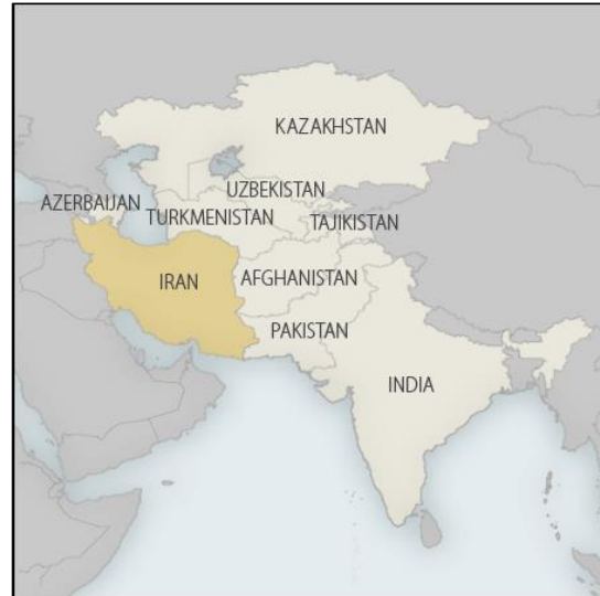
Figure 4. South and Central Asia Region

Most of the Central Asia states that were part of the Soviet Union are governed by authoritarian leaders. Afghanistan remains politically weak, and Iran is able to exert influence there. Some countries in the region, particularly India, seek greater integration with the United States and other world powers and tend to downplay cooperation with Iran.