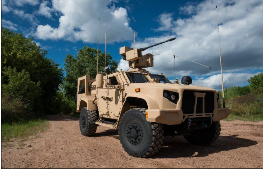
Figure 2. Illustrative LRV