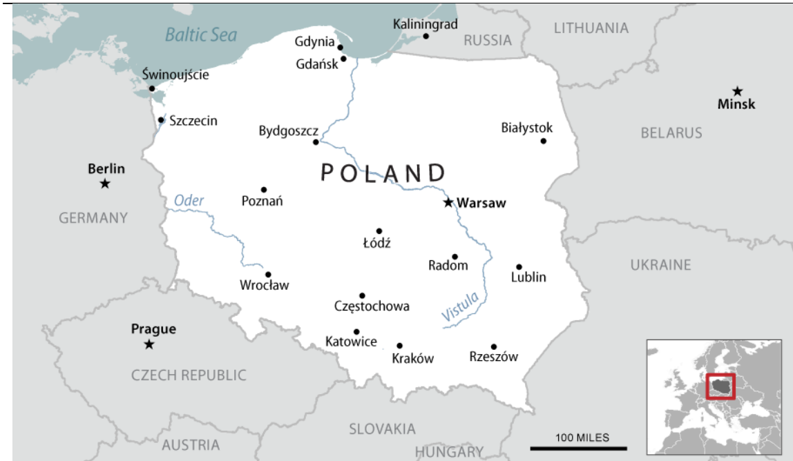
Figure I. Poland at a Glance: Map and Basic Facts

Area: Land area is about 120,728 sq. mi.; slightly smaller than New Mexico.