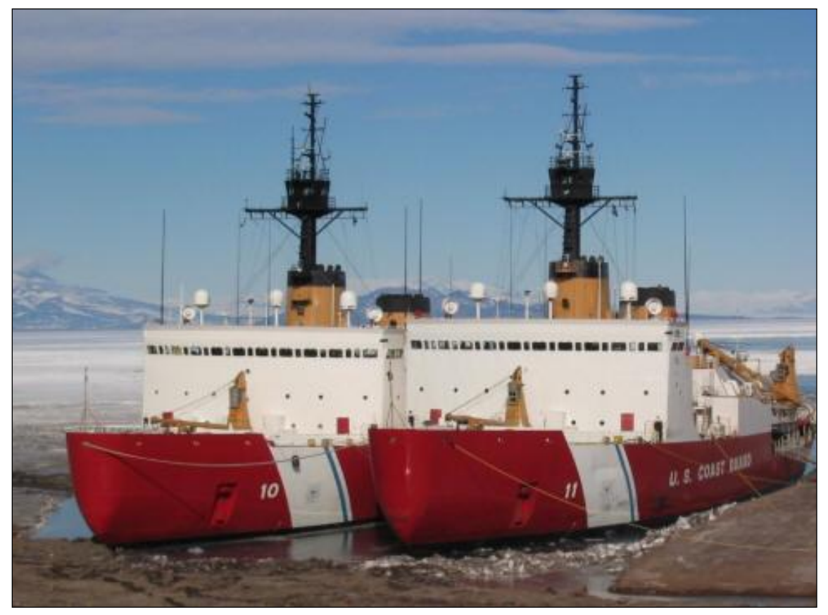
Figure A-I. Polar Star and Polar Sea (Side by side in McMurdo Sound, Antarctica)

equipment from Polar Sea to Polar Star to facilitate Polar Star 's return to service,<sup>52</sup> and continues to use Polar Sea as a source of spare parts for Polar Star .