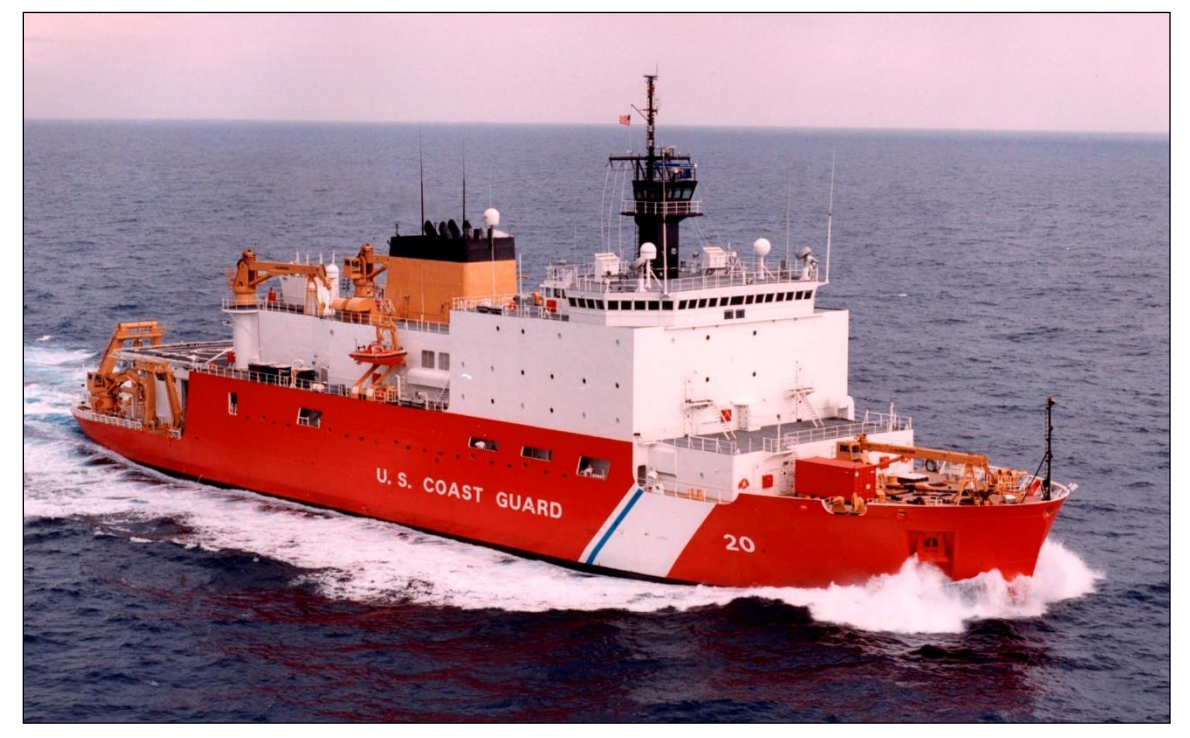
Figure A-3. Healy

the peninsula. The ship might be considered less an icebreaker than an oceanographic research ship with enough icebreaking capability for the Antarctic Peninsula. Palmer's icebreaking capability is not considered sufficient to perform the McMurdo resupply mission.