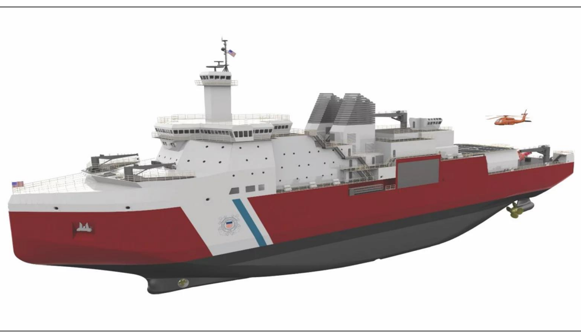
Figure 1. Rendering of VT Halter Design for PSC

Figure 1 , Figure 2 , and Figure 3 show three renderings of VT Halter's design for the PSC. An April 25, 2019, press report states that "the Coast Guard and Navy said VT Halter Marine's winning design for the new Polar Security Cutter (PSC) 'meets or exceeds all threshold requirements' in the ship specification" for the PSC program.<sup>15</sup>