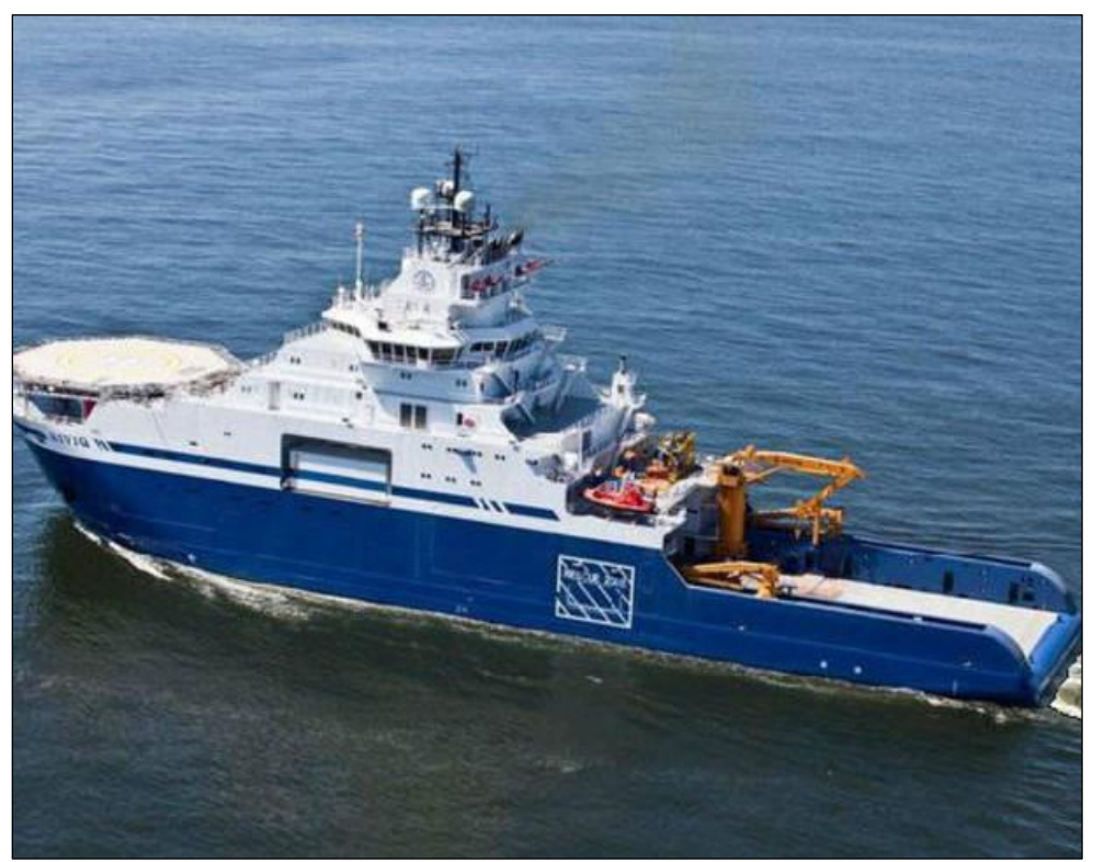
Figure 5. Aiviq

I know the last time we had a study, it was 1980. That's a long time ago. So is there a way we can put metal on the water, especially for the new shipping through and the—and the cruise ships, because that Healy is old, and—is—have you looked at that at all?