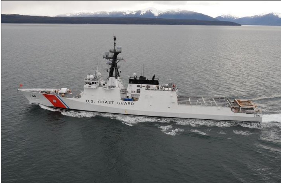
Figure 1. National Security Cutter