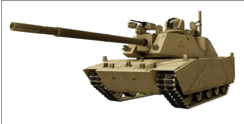
Figure 7. Illustrative RCV–H