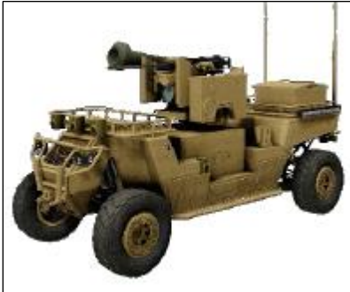
Figure 5. Illustrative RCV–L