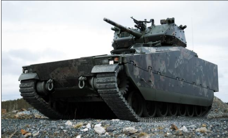
Figure 2. BAE Prototype CV-90