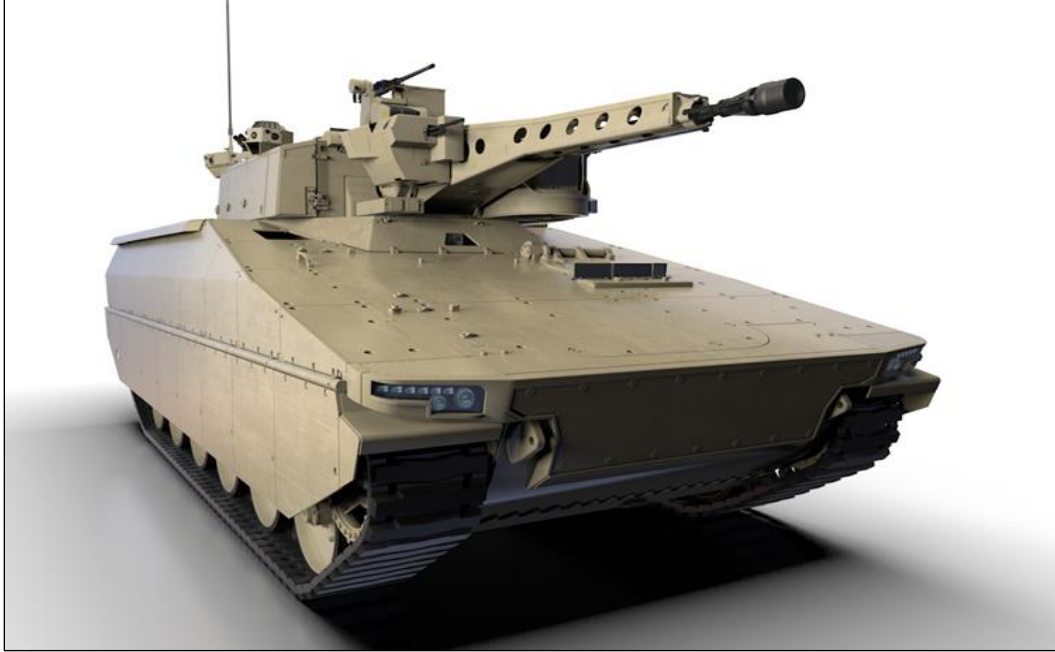
Figure 4. Raytheon/Rheinmetall Lynx Prototype

Source: https://www.rheinmetall-defence.com/en/rheinmetall_defence/systems_and_products/vehicle_systems/armoured_tracked_vehicles/lynx/index.php , accessed January 31, 2019.