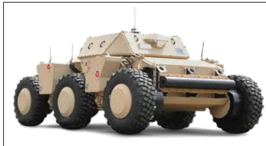
Figure 6. Illustrative RCV–M