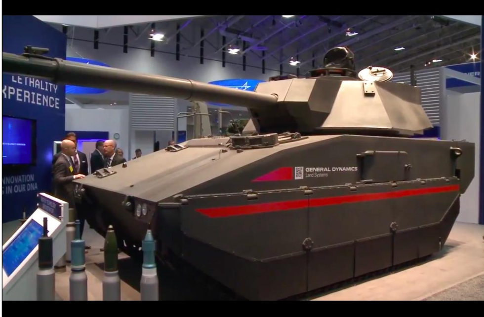
Figure 3. GDLS Griffin III Prototype