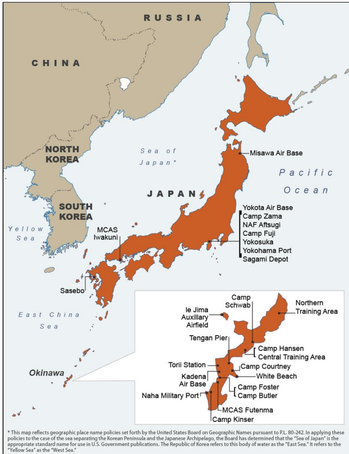
Figure 4. Map of U.S. Military Facilities in Japan