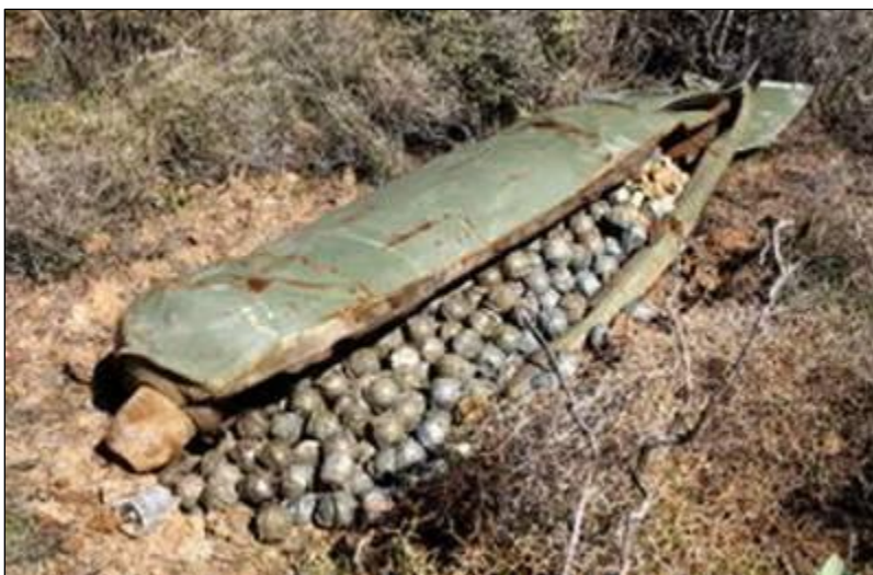
Figure 2. Unexploded Aerial Cluster Bomb and Submunitions