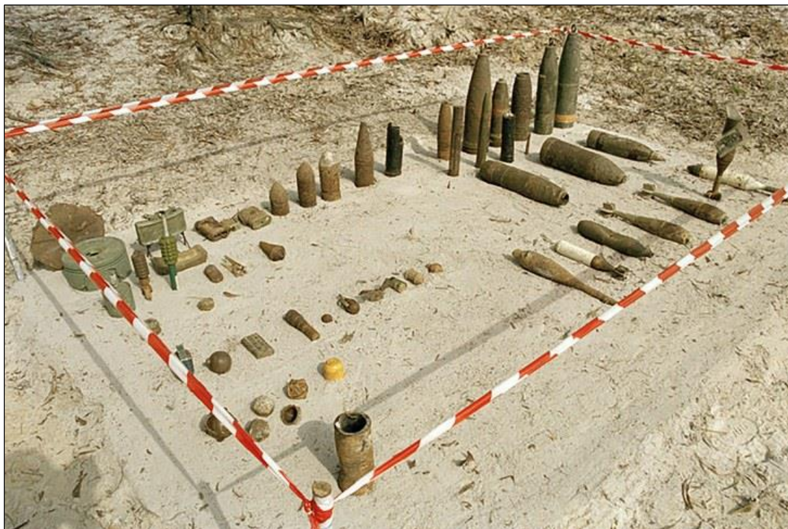
Figure 1. UXO Recovered in Vietnam, 2005