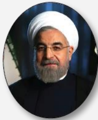
Dr. Hassan Rouhani

Hassan Rouhani is a Hojjat ol-Islam in the Shiite clergy, one rank below Ayatollah. He was born in 1948. He holds a Ph.D. in law from Glasgow Caledonian University in Scotland. Rouhani is a long-time regime stalwart who was part of Ayatollah Khomeini's circle prior to the triumph of the Islamic revolution. He is also an associate and protégé of Rafsanjani, and Rouhani's pragmatic policy approach on issues such as the nuclear issue and relations with the United States has complicated Rouhani's relations with Khamene'i. Khamene'i criticized Rouhani's economic and foreign policies during the 2017 presidential election period, appearing to seek Rouhani's defeat.