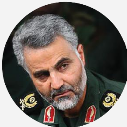
IRGC Major General Qasem Soleimani