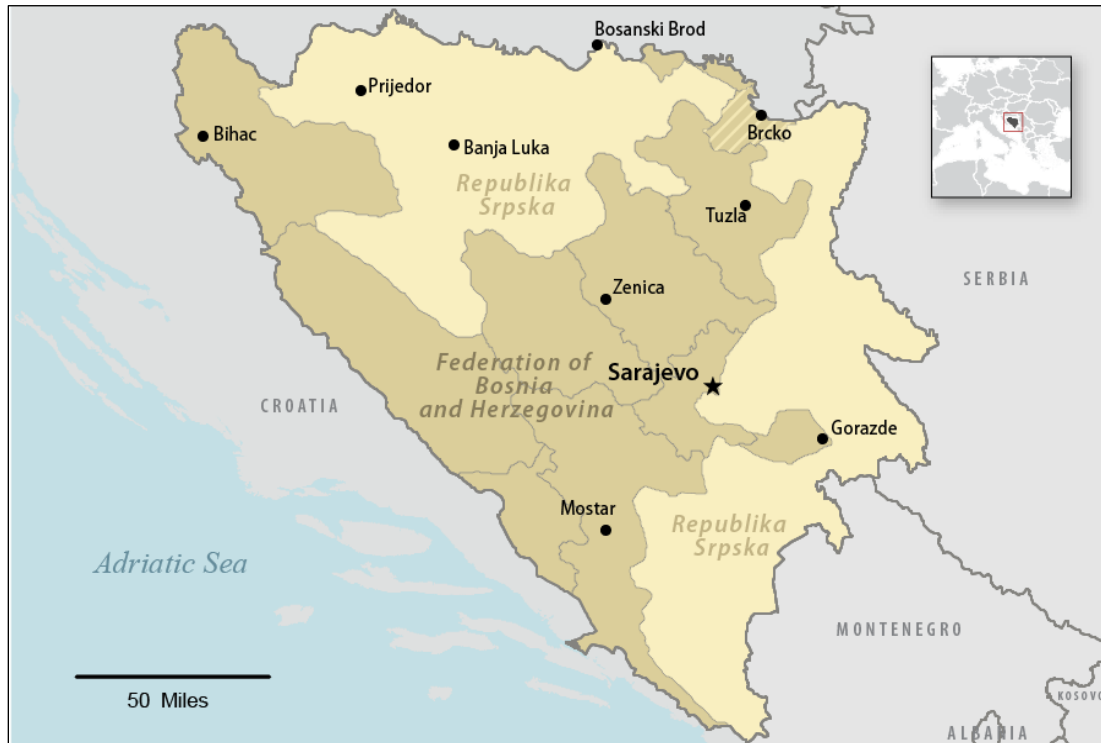
Figure I. Map of Bosnia and Herzegovina