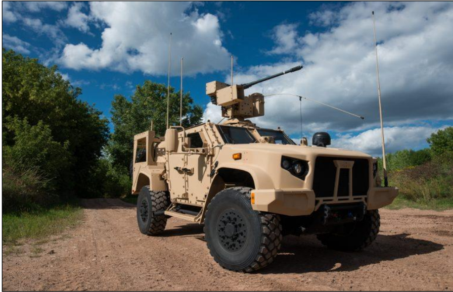
Figure 2. Illustrative LRV