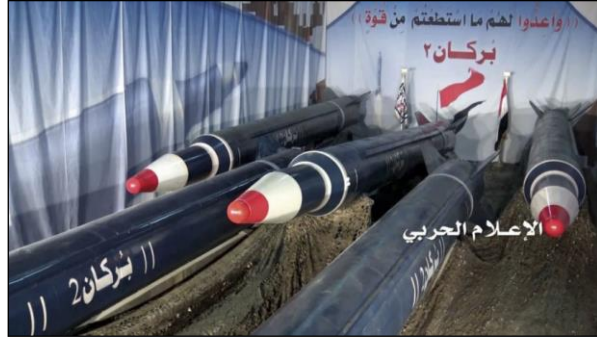
Figure 2. Houthi-Saleh Forces Display the “Burkan-2” Missile