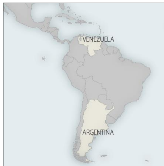
Figure 5. Latin America

Some U.S. officials and some in Congress have expressed concerns about Iran's relations with leaders in Latin America that share Iran's distrust of the United States. Some experts and U.S. officials have asserted that Iran has sought to position IRGC-QF operatives and Hezbollah members in Latin America to potentially carry out terrorist attacks against Israeli targets in the region or even in the United States itself. 163 Some U.S. officials have asserted that Iran and Hezbollah's activities in Latin America include money laundering and trafficking in drugs and counterfeit goods. 164 These concerns were heightened during the presidency of Mahmoud Ahmadinejad (2005-2013), who made repeated, high-profile visits to the region in an effort to circumvent U.S. sanctions and gain support for his criticisms of U.S. policies. However, few of the economic agreements that Ahmadinejad announced with Latin American countries were implemented, by all accounts.