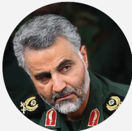
IRGC Major General Qasem Soleimani