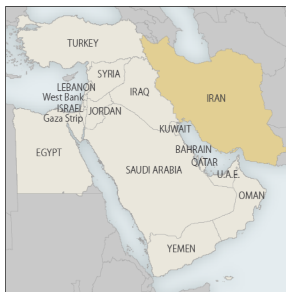
Figure 2. Map of Near East

The willingness of Qatar, Kuwait, and Oman to engage Iran contributed to a rift within the GCC in which Saudi Arabia, UAE, and Bahrain—joined by a few other Muslim countries—announced