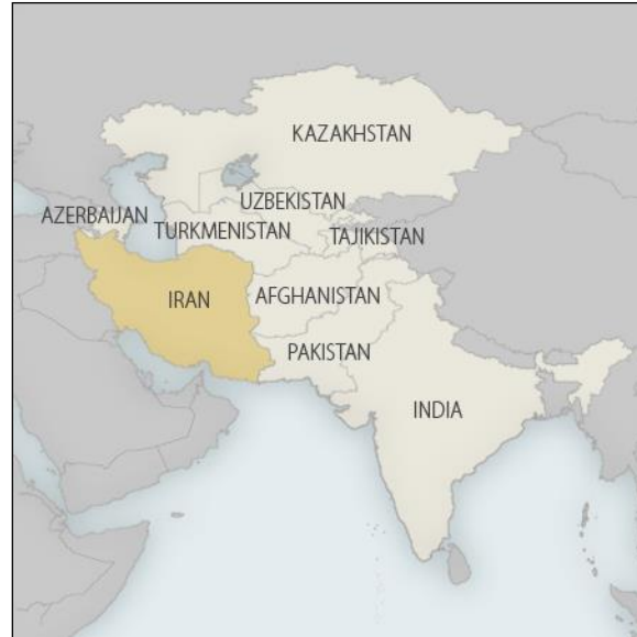
Figure 4. South and Central Asia Region

Most of the Central Asia states that were part of the Soviet Union are governed by authoritarian leaders. Afghanistan remains politically weak, and Iran is able to exert influence there. Some countries in the region, particularly India, seek greater integration with the United States and other world powers and tend to downplay cooperation with Iran. The following sections address countries that have significant economic and political relationships with Iran.