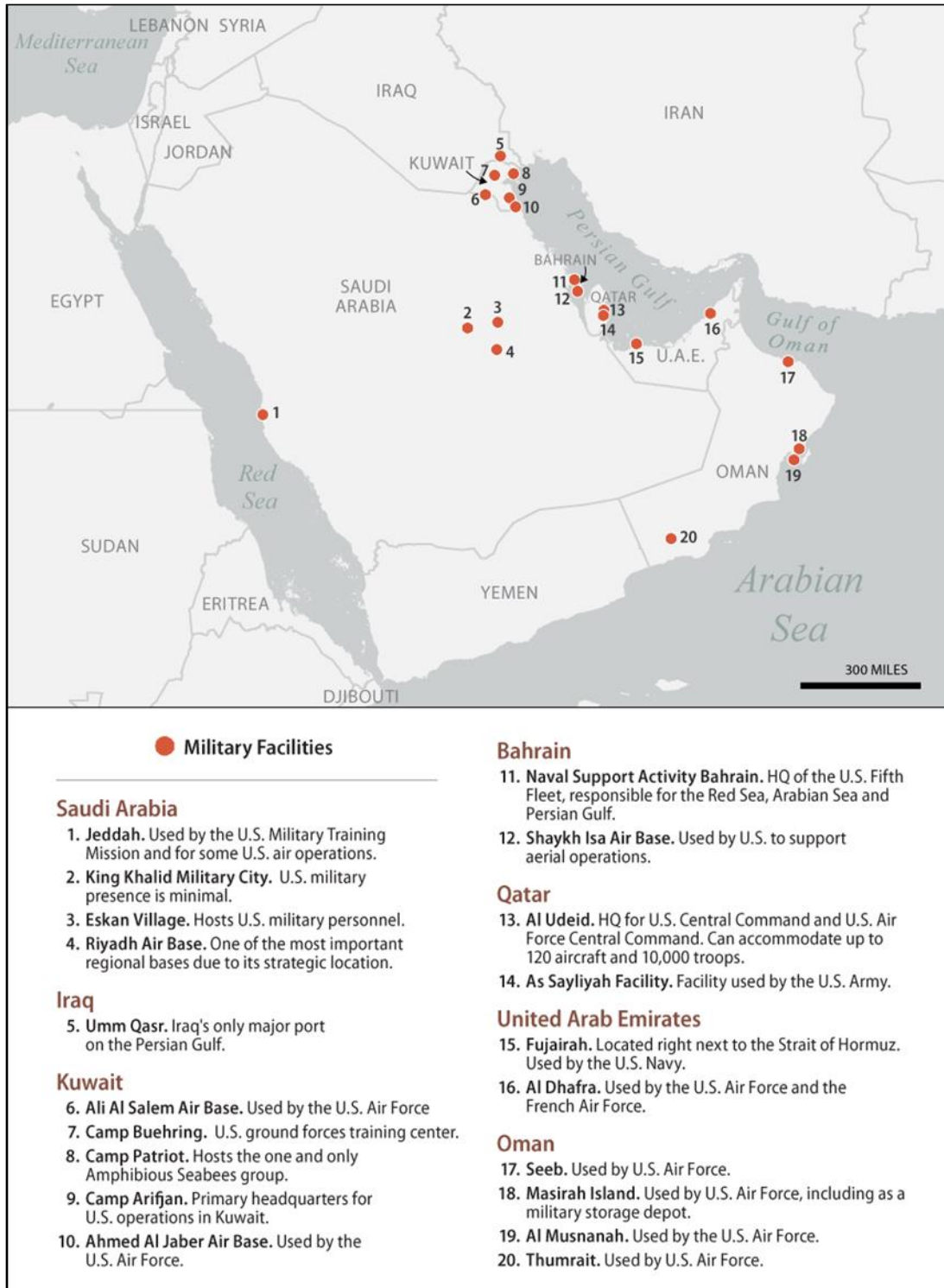
Figure 3. Major Persian Gulf Military Facilities