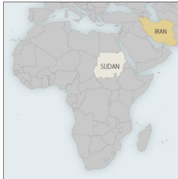
Figure 6. Sudan

Amid the Saudi-Iran dispute in January 2016 over the Nimr execution, several African countries that Iran had cultivated as potential allies broke relations with Iran outright, including Djibouti, Comoros, and Somalia, as well as Sudan. Senegal, at one time seen as a primary focus of Ahmadinejad's Africa outreach, and Sudan have supported the Saudi-led military effort against the Iran-backed Houthis in Yemen—in Sudan's case with some forces. 175 The UAE, in particular, has actively sought allies in the Horn of Africa to reduce Iranian influence, including by