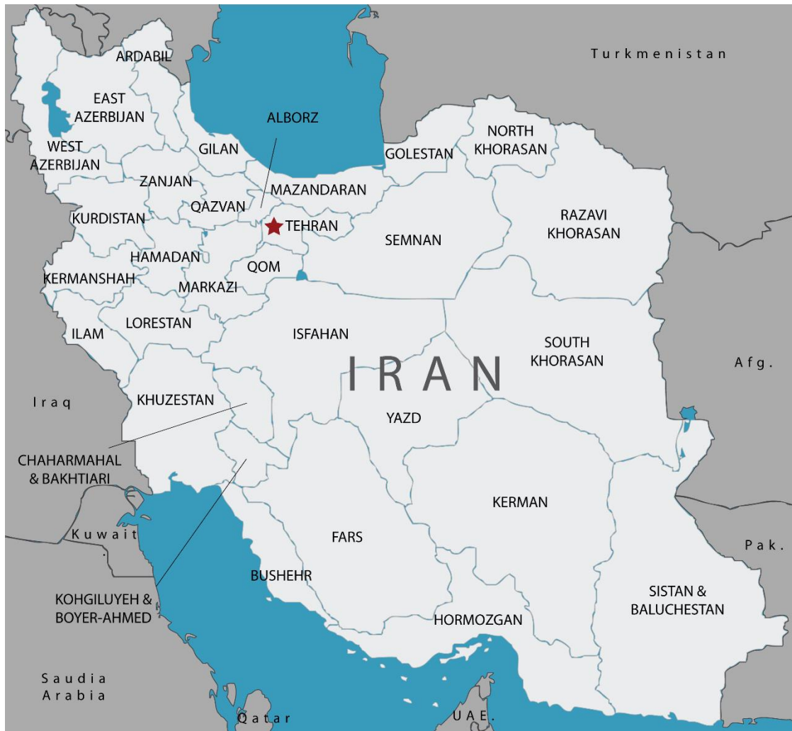
Figure 2. Map of Iran