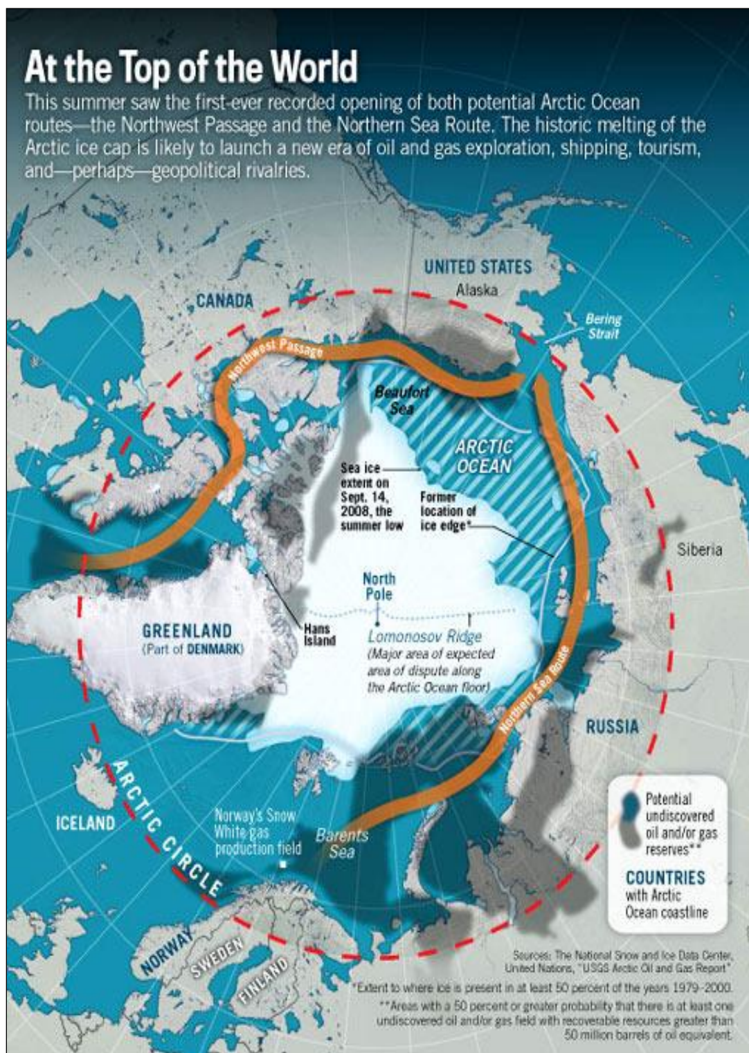
Figure 3. Arctic Sea Ice Extent in September 2008, Compared with Prospective Shipping Routes and Oil and Gas Resources