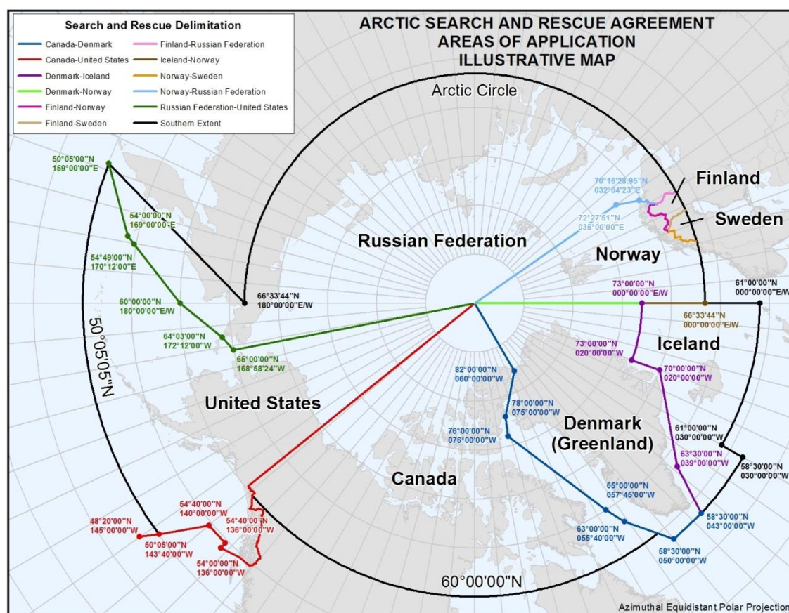
Figure 4. Illustrative Map of Arctic SAR Areas in Arctic SAR Agreement (Based on geographic coordinates listed in the agreement)

Source: "Arctic Search and Rescue Agreement," accessed July 7, 2011, at http://www.arcticportal.org/features/features-of-2011/arctic-search-and-rescue-agreement .