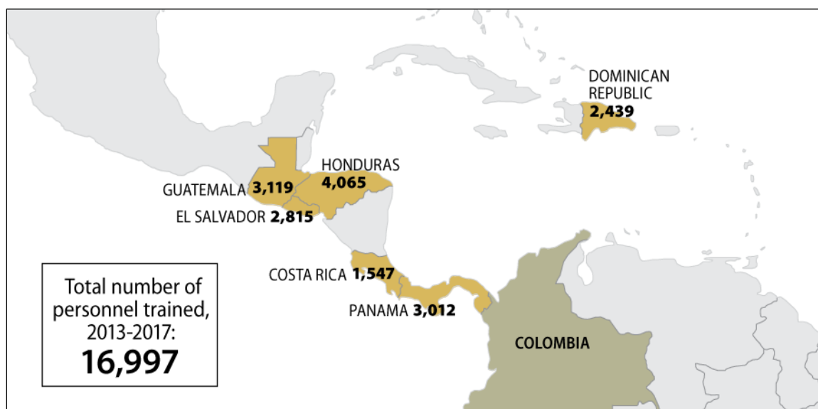
Figure 4. Third-Country Security Forces Trained Under the Action Plan on Regional Security Cooperation, 2013-2017

Source: Data from the Colombian Ministry of Defense provided by the Embassy of Colombia.