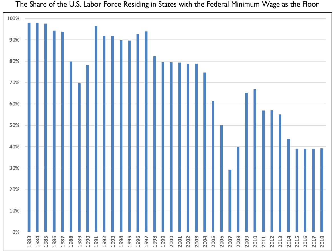
Figure 3. How Binding is the Federal Minimum Wage?