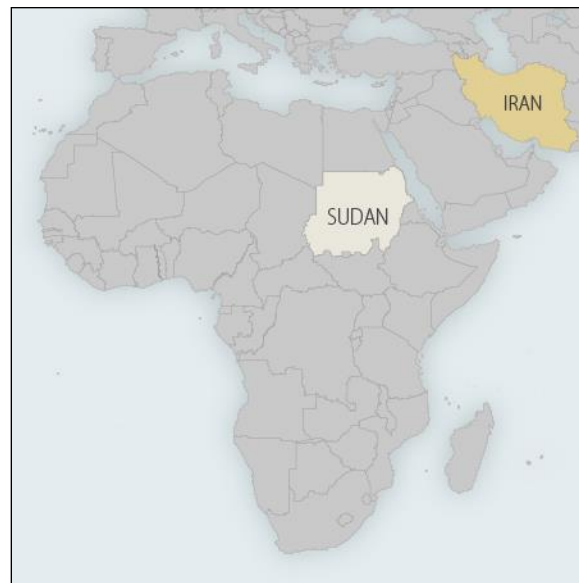
Figure 6. Sudan

Amid the Saudi-Iran dispute in January 2016 over the Nimr execution, several African countries that Iran had cultivated as potential allies broke relations with Iran outright, including Djibouti, Comoros, and Somalia, as well as Sudan. Senegal, at one time seen as a primary focus of Ahmadinejad's Africa outreach, and Sudan have supported the Saudi-led military effort against the Iran-backed Houthis in Yemen—in Sudan's case with some forces. 177 The UAE, in particular, has actively sought allies in the Horn of Africa to reduce Iranian influence, including by facilitating UAE operations against the Iran-backed Houthi rebels in Yemen. West Africa's large