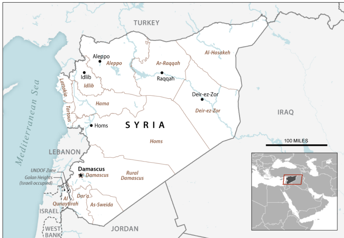
Figure 1. Syria: Map and Country Data

The U.N. has sponsored peace talks in Geneva, but it is unclear when (or whether) the parties might reach a political settlement that could result in a transition away from Asad. With many armed opposition groups weakened, defeated, or geographically isolated, military pressure on the Syrian government to make concessions to the opposition has been reduced. U.S. officials have stated that the United States will not fund reconstruction in Asad-held areas unless a political solution is reached in accordance with U.N. Security Council Resolution 2254. 5