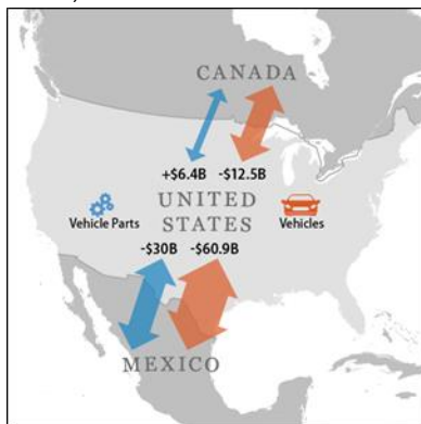
Figure 2. U.S. Motor Vehicle and Parts Trade Balance (2018, $ in billions)