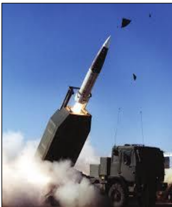
Figure 4. ATACMS Launching