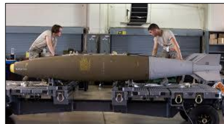
Figure 2. GBU-31 Joint Direct Attack Munition