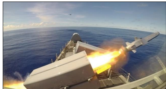
Figure 5. NSM at Launch