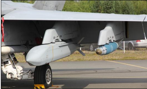
Figure 3. JASSM Attached to an F/A-18D Hornet