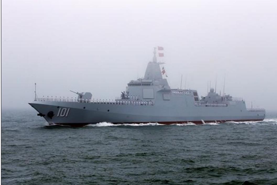
Figure 11. Renhai (Type 055) Cruiser (or Large Destroyer)