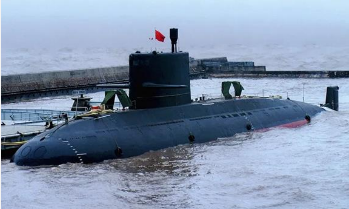
Figure 4. Yuan (Type 039) Attack Submarine (SS)