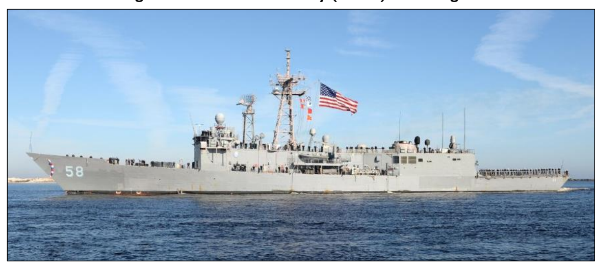
Figure 1. Oliver Hazard Perry (FFG-7) Class Frigate

The most recent class of frigates operated by the Navy was the Oliver Hazard Perry (FFG-7) class ( Figure 1 ). A total of 51 FFG-7 class ships were procured between FY1973 and FY1984. The ships entered service between 1977 and 1989, and were decommissioned between 1994 and 2015.