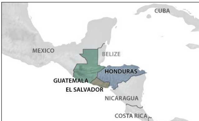
Figure 1. Northern Triangle of Central America

An estimated 250,000-300,000 people have left the Northern Triangle region of Central America (composed of El Salvador, Guatemala, and Honduras) in each of the past five years, with the majority bound for the United States. According to the digital publication Lawfare , trends through the first five months of FY2019 suggest that the number of people leaving the region could double this year. Although total U.S. apprehensions of unauthorized migrants have been near historic lows in recent years, the arrival at the Southwest border of a growing number of Central American families and children, many of whom are seeking asylum, reportedly has strained the U.S. immigration system. Congress has sought to understand and address the root causes of these migration trends.