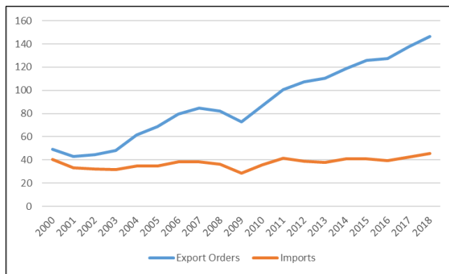
Figure 2. Comparison of U.S. Export Orders Placed with Taiwanese Firms and U.S. Data on Merchandise Imports from Taiwan: 2000-2018 ($billions)

Source: Taiwan export order data are from the Taiwan Ministry of Economic Affairs. Data on U.S. imports are from the USITC.