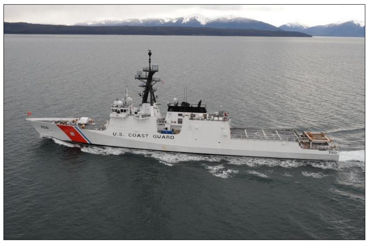
Figure I. National Security Cutter

National Security Cutters ( Figure 1 )—also known as Legend (WMSL-750)<sup>12</sup> class cutters because they are being named for legendary Coast Guard personnel<sup>13</sup>—are the Coast Guard's largest and most capable general-purpose cutters.<sup>14</sup> They are larger and technologically more advanced than Hamilton-class cutters, and are built by Huntington Ingalls Industries' Ingalls Shipbuilding of Pascagoula, MS (HII/Ingalls).