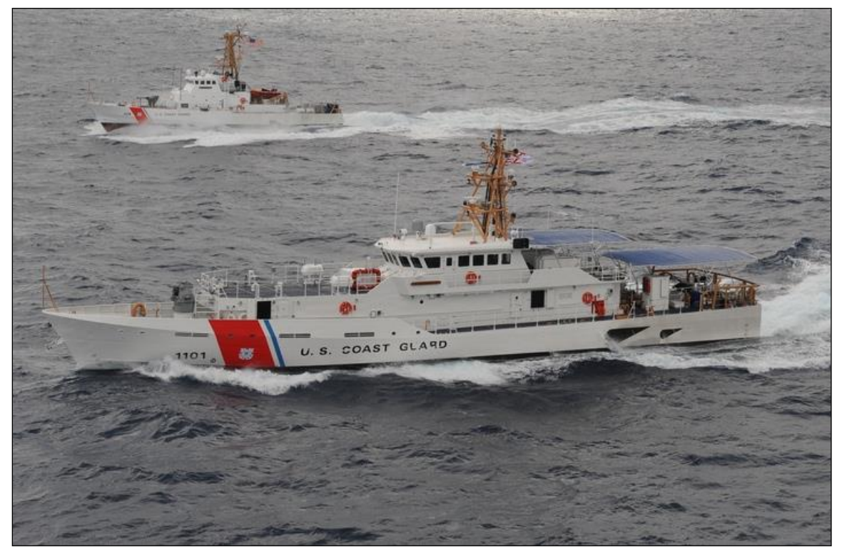
With an older Island-class patrol boat behind