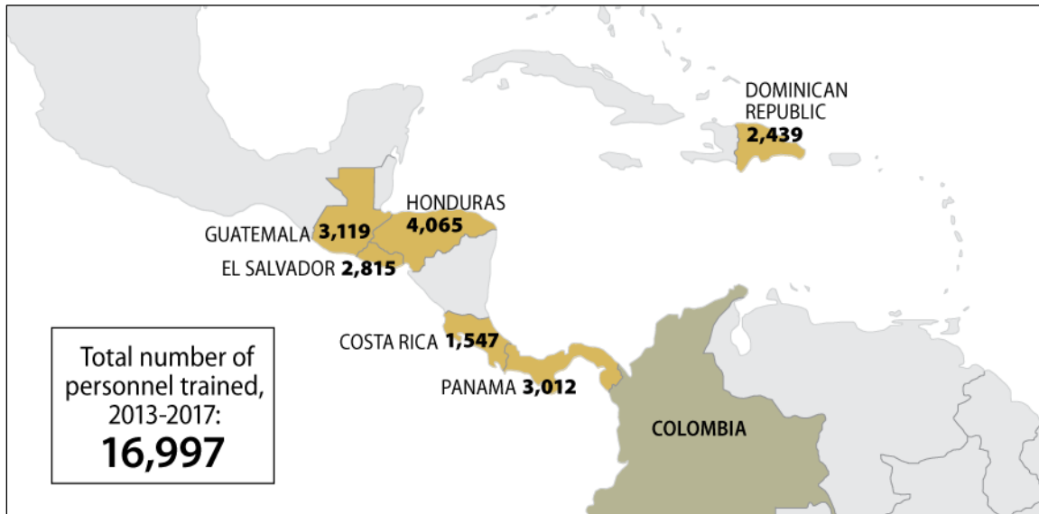
Figure 4. Third-Country Security Forces Trained Under the Action Plan on Regional Security Cooperation, 2013-2017

Source: Data from the Colombian Ministry of Defense provided by the Embassy of Colombia.