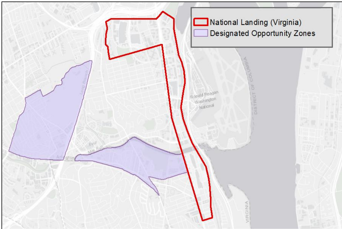
Figure 2. Designated Opportunity Zones Near Amazon Proposed HQ2 Site in Northern Virginia