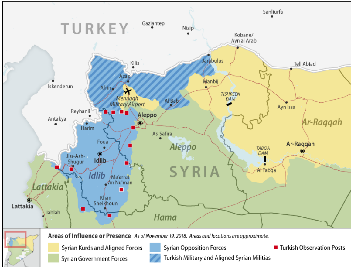
Figure 5. Northern Syria Areas of Control As of November 19, 2018