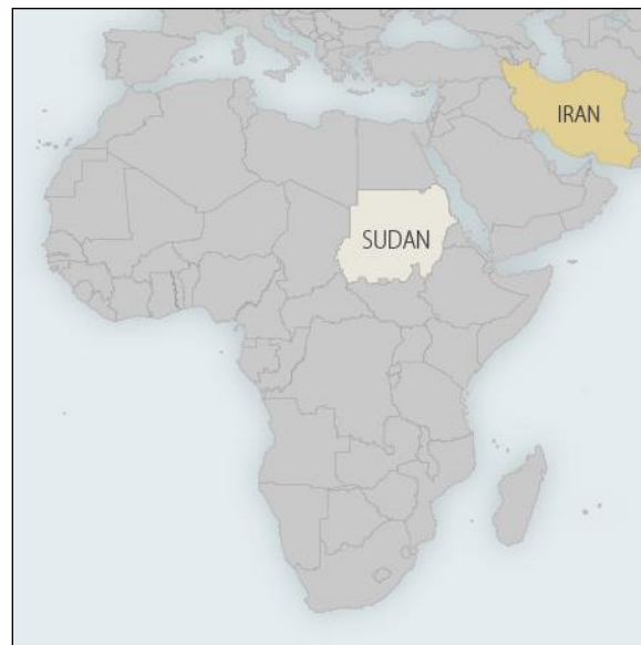
Figure 5. Sudan

Amid the Saudi-Iran dispute in January 2016 over the Nimr execution, several African countries that Iran had cultivated as potential allies broke relations with Iran outright, including Djibouti, Comoros, and Somalia, as well as Sudan. Senegal, at one time seen as a primary focus of Ahmadinejad's Africa outreach, and Sudan have supported the Saudi-led military effort against the Iran-backed Houthis in Yemen—in Sudan's case with some forces. 175 The UAE, in particular, has actively sought allies in the Horn of Africa to reduce Iranian influence, including by facilitating UAE operations against the Iran-backed Houthi rebels in Yemen. West Africa's large