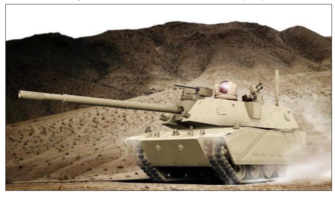
Figure 6. Notional Robotic Combat Vehicle (RCV)