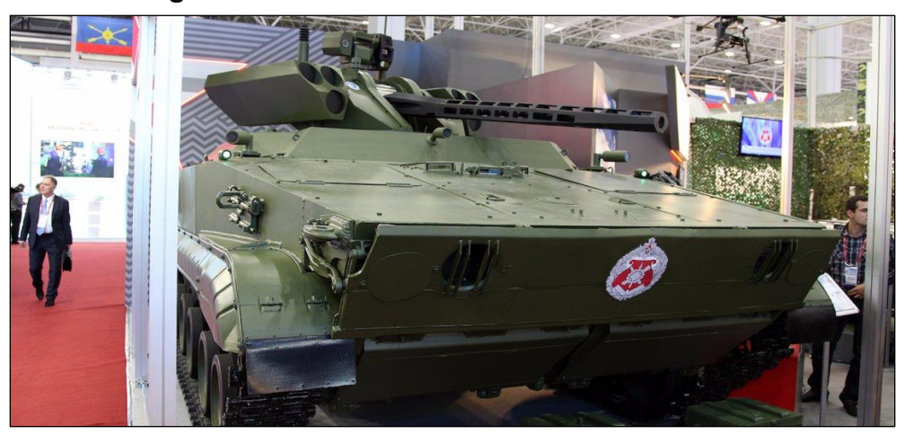
Figure 1. Russian Vikhr Unmanned Ground Vehicle