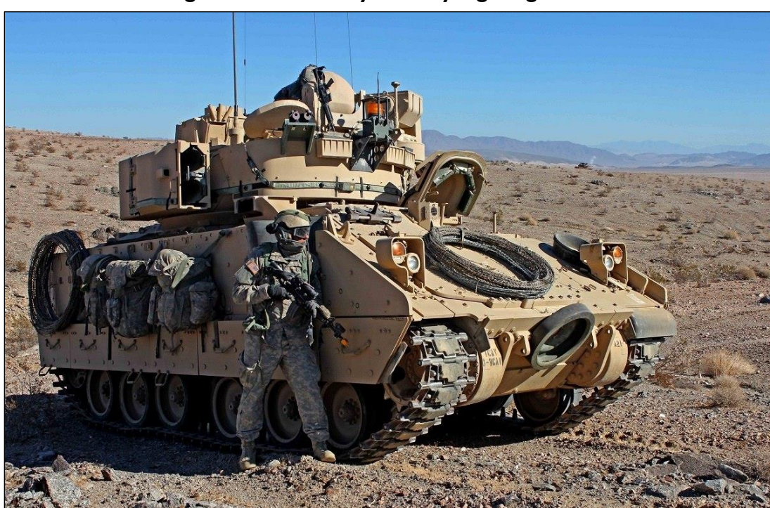
Figure 7. M-2 Bradley Infantry Fighting Vehicle

Source: Maddy Longwell, "The Army Hopes Al Can Help Prevent Vehicle Failure," C4ISRNet, June 26, 2018.