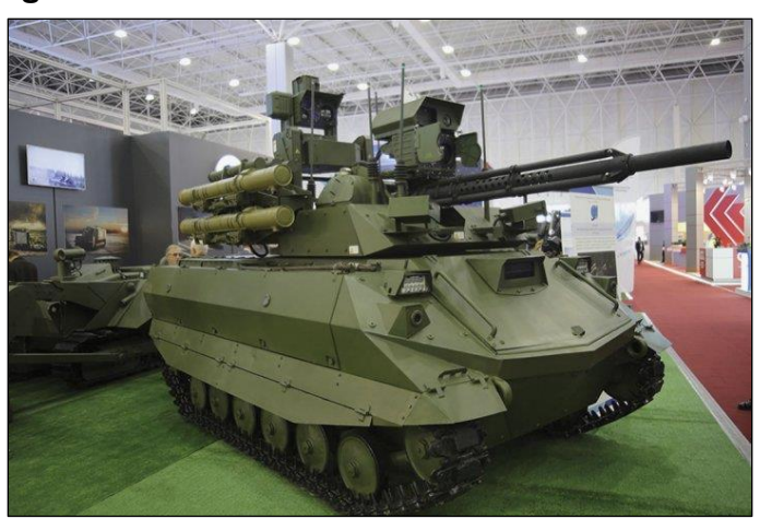
Figure 2. Russian Uran-9 Unmanned Ground Vehicle