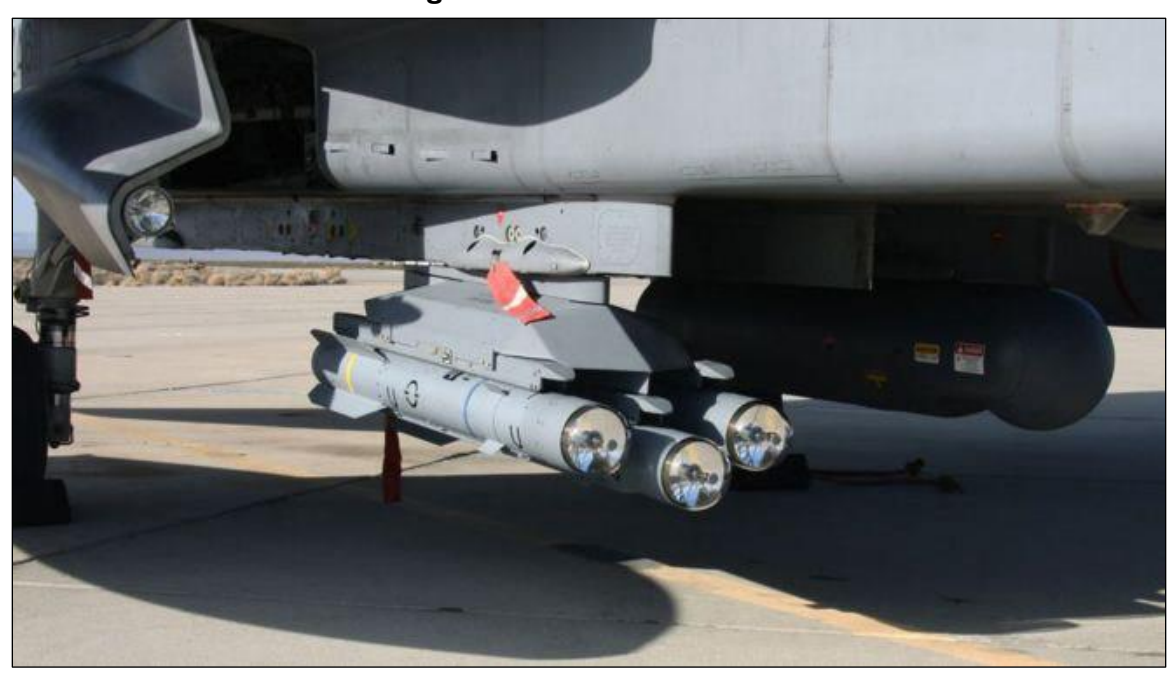
Figure 3. Brimstone Missile