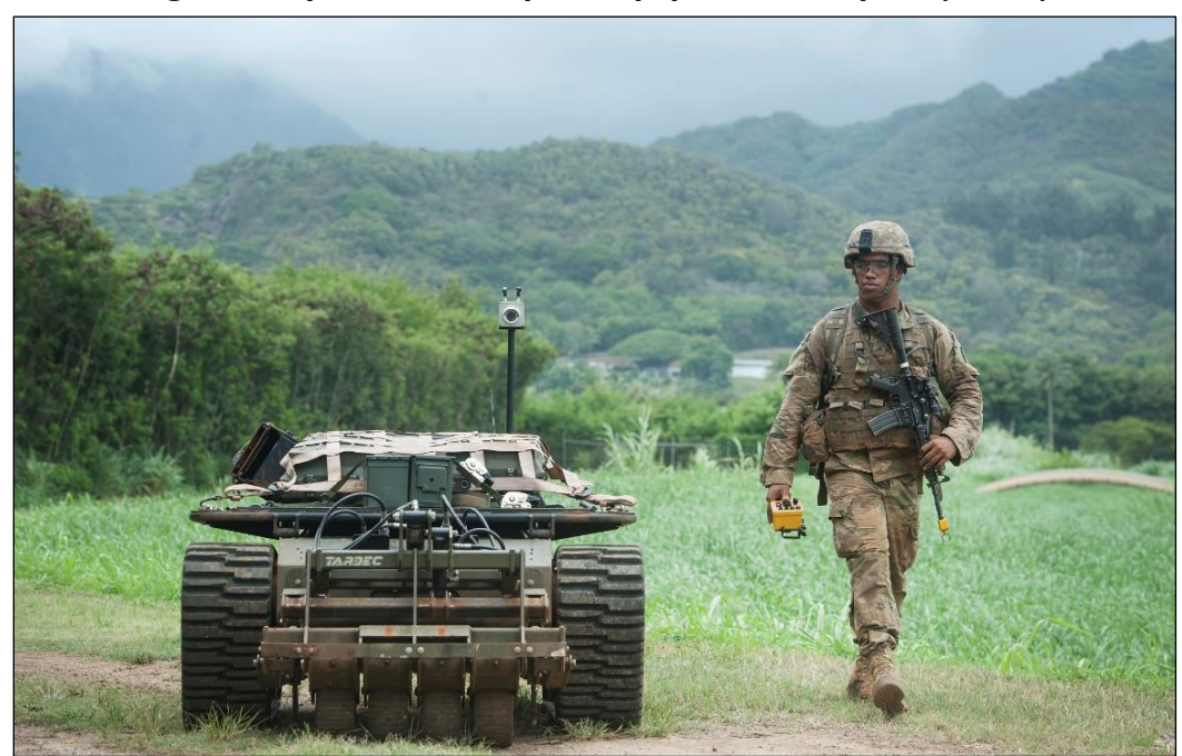
Figure 4. Squad Multi-Purpose Equipment Transport (SMET)