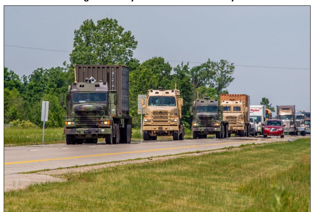
Figure 5. Army Leader-Follower Convoy

Source: Kevin Lilley, "Driverless Army Convoys: 6 Takeaways from the Latest Test," Army Times, July 1, 2016.