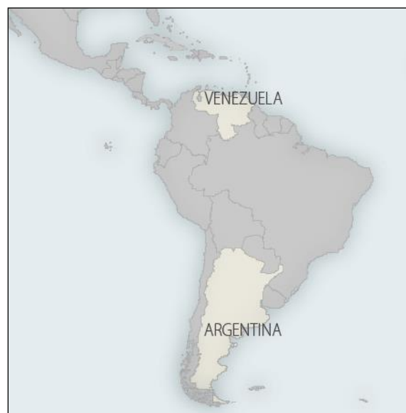
Figure 4. Latin America

President Rouhani has generally expressed only modest interest in further expanding ties in Latin America, perhaps in part because Latin America is not pivotal to Iran's economy. 164 He made his first visit to the region in September 2016 (three years into his presidency) in the course of