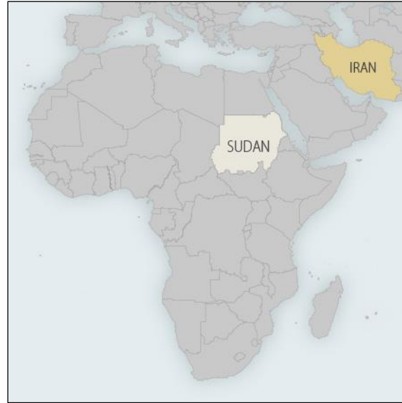
Figure 5. Sudan

Rouhani has made few statements on relations with countries in Africa and has apparently not made the continent a priority. Tehran appears, however, to retain an interest in cultivating African countries as trading partners—an interest that might increase now that the Trump Administration has decided to exit the JCPOA and reimpose all U.S. sanctions. Iran's leaders also apparently see Africa as a market for its arms exports and as sources of diplomatic support in U.N. forums. 175 African populations may also be seen as potential targets for Iranian "soft power" and religious influence. Iran's Al Mustafa University, which promotes Iran's message and Shiite religious orientation with branches worldwide, has numerous branches in various African countries. 176