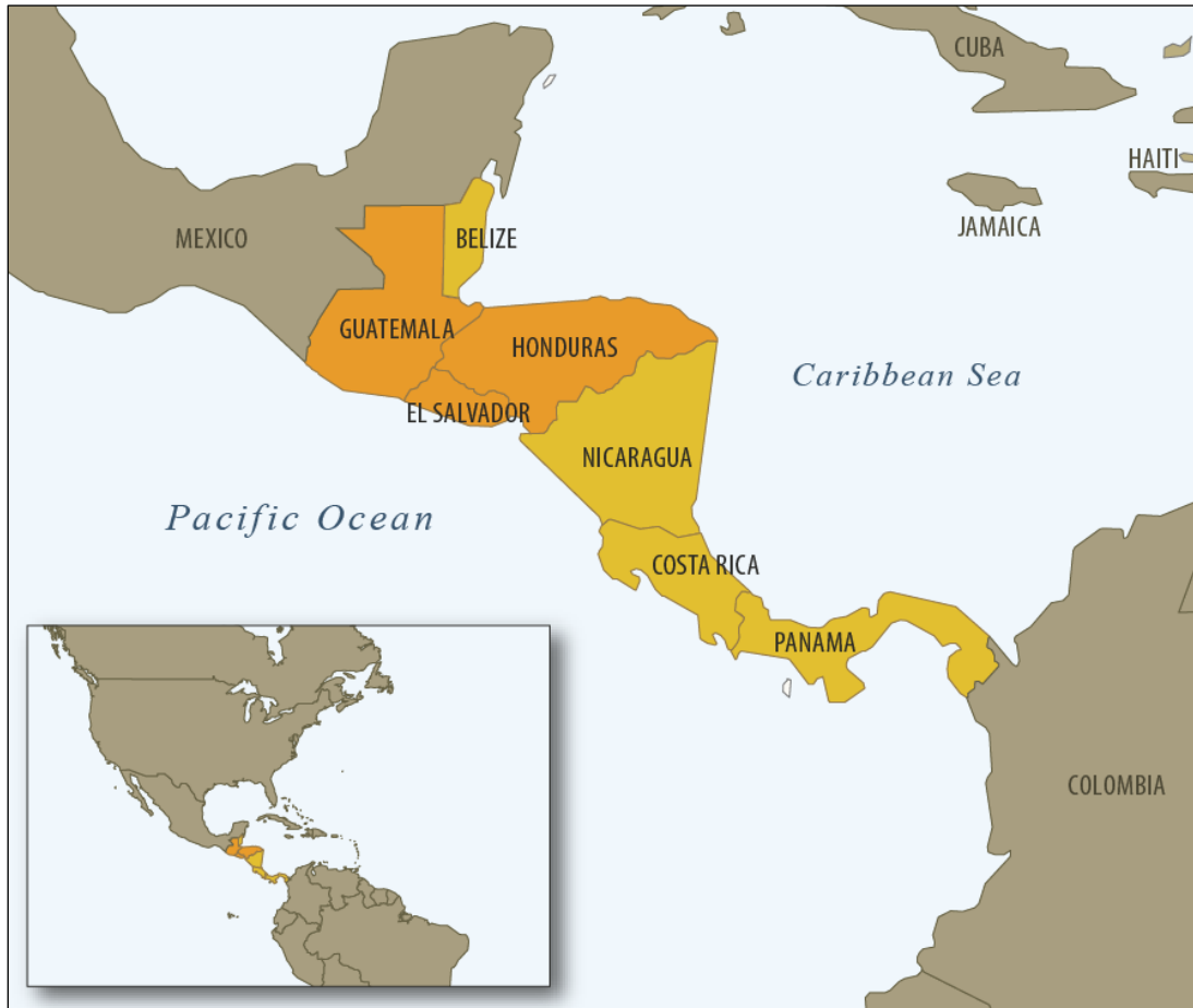
Figure 3. Map of Central America

two years, the Administration has sought to cut foreign aid to Central America by more than a third and has placed a greater emphasis on security concerns. As noted above (see “Migration Issues”), the Administration also has implemented a series of immigration policy changes that affect Central Americans living in the United States without authorization, including the phaseout of the DACA program and the termination of TPS for Salvadorans and Hondurans. The northern triangle governments have raised concerns that the Administration’s efforts to reduce assistance while simultaneously increasing deportations could exacerbate poverty and instability in the region.