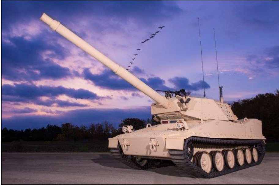
Figure 3. Illustrative MPF