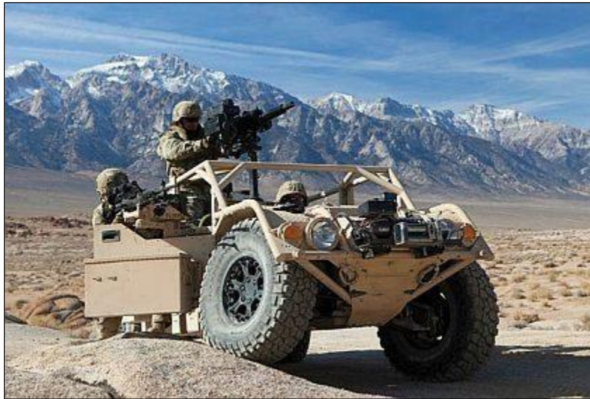
Figure I. Illustrative GMV